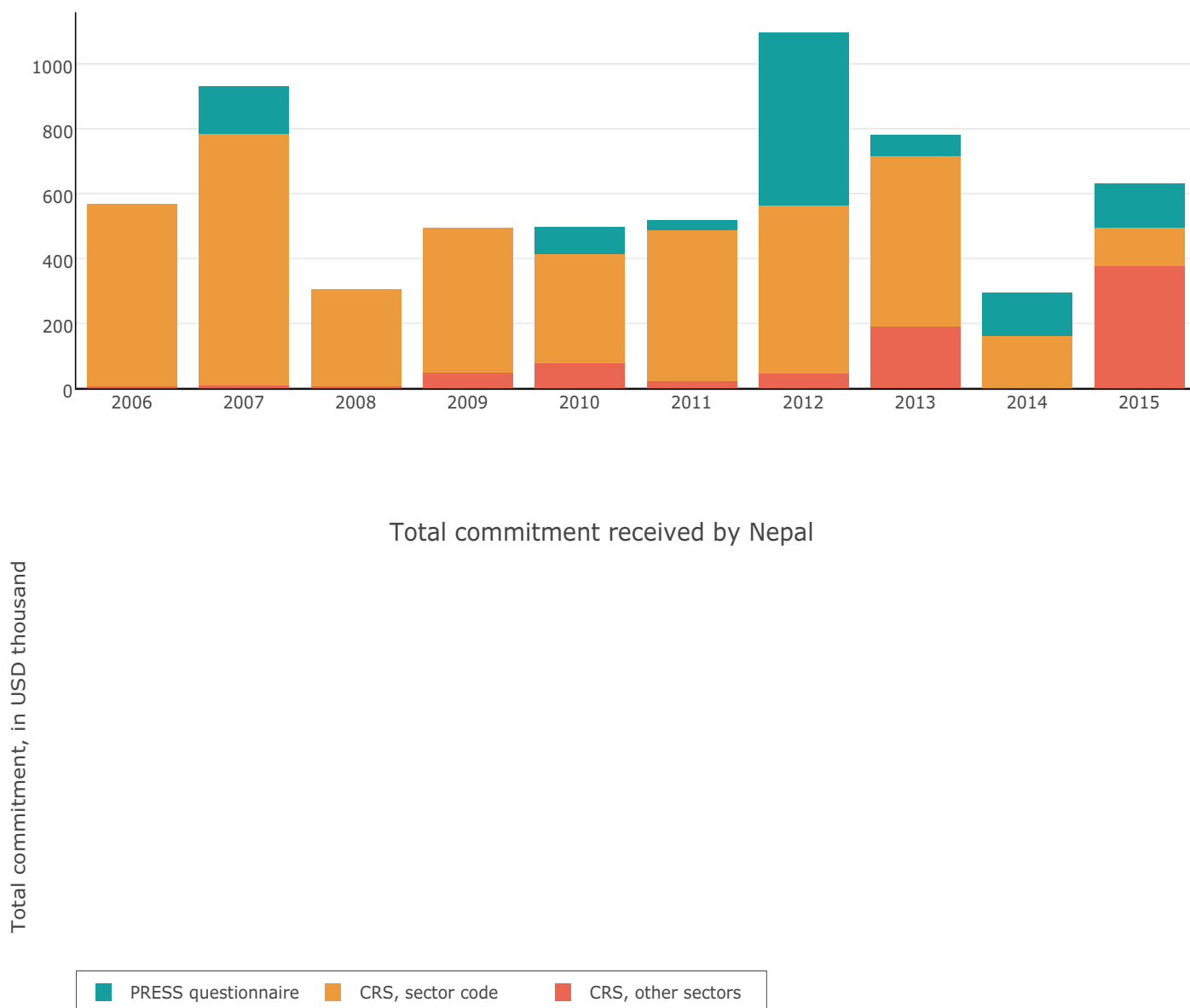
Fig2. International Commitments to Statistics of Nepal

2009 and increased thereafter. From 2013 to 2015, the share of country-specific aid remained stable at 60%. More regional and unallocated commitments should be observed considering the SDG's focus on the planet and environment.