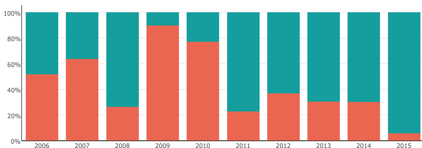
Allocation of aid to Statistics received by Nepal

With the most recent data, PRESS 2017 shows that total aid to statistics received by Nepal amounts to USD 1,709,558 in 2013-2015.