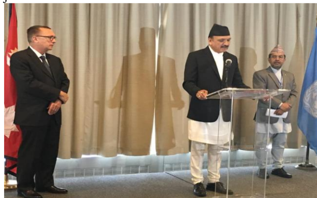
Hon. Minister addressing the National Day Reception gathering, with H.E. the Permanent Representative and Under Secretary-General Mr. Geoffrey Feltman on the background

During the visit to New York, the Foreign Minister also observed the National Day reception hosted by the Permanent Representative of Nepal to the United Nations Ambassador Durga Prasad Bhattarai to mark the first anniversary of the promulgation of the Constitution of Nepal. Addressing the programme, the Foreign Minister highlighted that the Constitution of Nepal "adheres to universally accepted norms of democratic polity; and ensures pluralism, the rule of law, representative and accountable government, and social and economic justice."