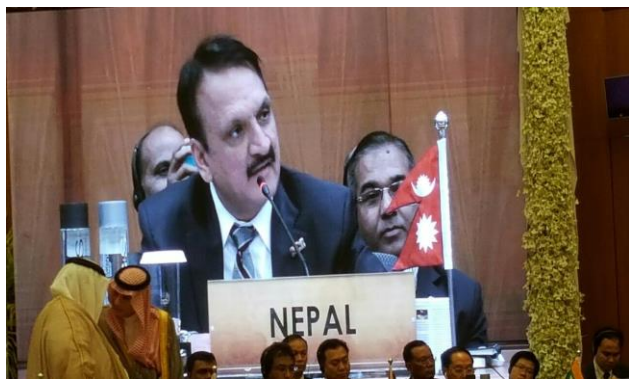
Hon. Foreign Minister of Nepal Dr. Prakash Sharan Mahat (Left) addressing the ACD Ministerial Meeting in New York.

The United Arab Emirates, as the incoming Chair of the Asia Cooperation Dialogue (ACD) hosted the ACD Foreign Ministers' Meeting on the sidelines of 71 st Session of the UNGA in New York on 22 September 2016.