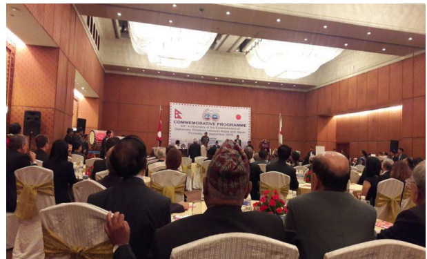
Commemorative Programme to celebrate the 60th anniversary of the establishment of diplomatic relations between Nepal and Japan

The Ministry of Foreign Affairs of Nepal organized a commemorative program to celebrate the 60th anniversary of the establishment of diplomatic relations between Nepal and Japan in Kathmandu on 1 September 2016. The Rt. Hon. Prime Minister Mr. Pushpa Kamal Dahal 'Prachanda' inaugurated the program by lighting the oil-fed traditional Nepali lamp. Speaking at the program Hon. Dr. Prakash Sharan Mahat, Minister for Foreign Affairs of Nepal highlighted the various aspects of Nepal-Japan relations and expressed happiness over the steady growth of these relations over the past six decades. He appreciated the substantial assistance provided by Japan in socio-economic development of Nepal which has been used in infrastructures and human resources development, among others.