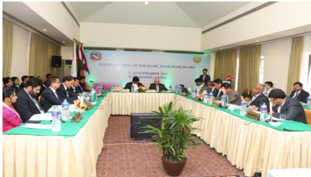
Hon. Mr. Deepak Bohara (Right in the Centre), Minister for Supplies of Nepal, addressing the inaugural session of the Ninth SAARC Food Bank Board Meeting in Kathmandu.

the uncertainty was not over. He expressed hope that the Board through a candid exchange of ideas would arrive at a mechanism tailored to overarching food security goals and objectives of the SAARC region. The meeting also agreed on the draft text of the Agreement on establishing the SAARC Food Bank incorporating the amendment proposals made by member countries.