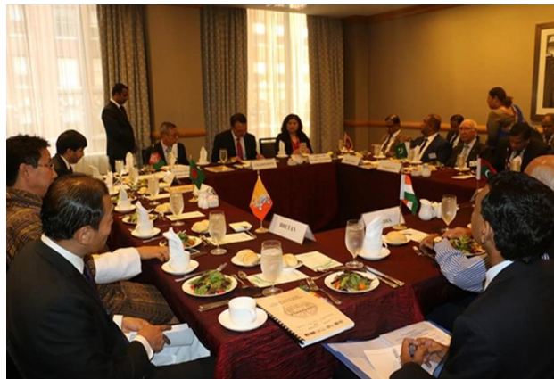
Hon. Dr. Prakash Sharan Mahat, Foreign Minister of Nepal, addressing the Meeting of the SAARC Council of Ministers on the sidelines of the 71 st session of the UNGA in New York.

On the sidelines of the 71 st session of the United Nations General Assembly, the Informal Meeting of the SAARC Council of Ministers was held in New York on 21 September 2016 with participation of all eight member states of SAARC. Hon. Minister for Foreign Affairs Dr. Prakash Sharan Mahat, as the current Chair of the SAARC Council of Ministers, presided over the Meeting. The Meeting reviewed progress achieved on the implementation of the decisions of the 37 th Meeting of the SAARC Council of Ministers and its preceding meetings held in Pokhara in March 2016. During the occasion, the head of delegation of Pakistan briefed about the ongoing preparations for hosting the 19 th SAARC Summit scheduled to be held in Pakistan on 9 to 10 November 2016.