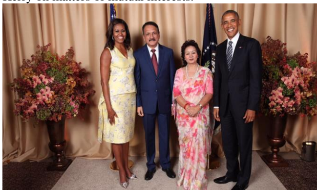
Foreign Minister and Mrs. Mahat with US President and Mrs. Obama

On 20 September 2016, the Hon. Dr. Mahat attended a reception hosted in honour of visiting heads of delegations by His Excellency Barack Obama, the President of the United States of America. During the occasion, he had a brief exchange of views with President Obama and also talked with US Secretary of State His Excellency Mr. John Kerry on matters of mutual interests.