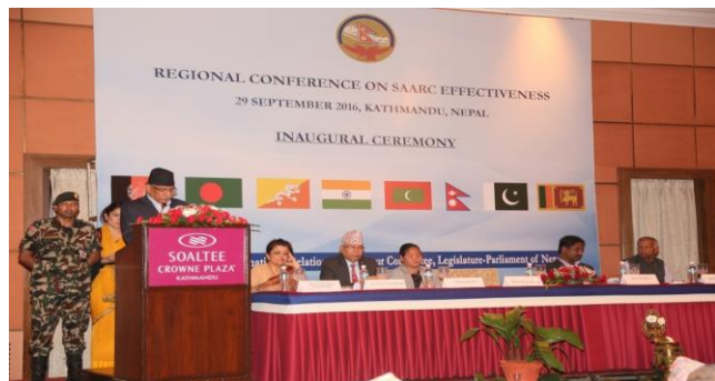
Rt. Hon. Mr. Pushpa Kamal Dahal 'Prachanda', Prime Minister of Nepal, addressing the inaugural ceremony of the Regional Conference on SAARC Effectiveness in Kathmandu.

Member Countries and resource persons (paper presenters and commentators) were also invited to attend the Conference. The Conference was inaugurated by the Rt. Hon. Prime Minister of Nepal Pushpa Kamal Dahal 'Prachanda'.