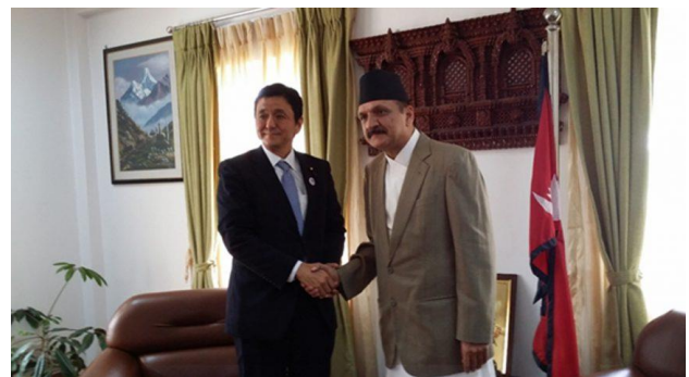
Hon. Dr. Prakash Sharan Mahat, Minister for Foreign Affairs of Nepal and H.E. Mr. Nobuo Kishi, Minister of State for Foreign Affairs of Japan

At the invitation of the Government of Nepal, H.E. Mr. Nobuo Kishi, Minister of State for Foreign Affairs of Japan paid a visit to Nepal from 30 August to 1 September 2016 leading a Japanese delegation to attend the commemorative programme organized by the Ministry of Foreign Affairs, Government of Nepal to celebrate the sixtieth anniversary of the establishment of diplomatic relations between Nepal and Japan.