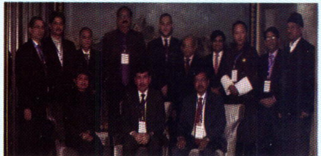
Representatives from the member countries meeting of the Governing Board of STAC

Twenty-sixth Meeting of the Governing Board of STAC (SAARC TB and HIV/AIDS Center) was held in Kathmandu on 11-12 January 2017. The Governing Board Members from Afghanistan, Bangladesh, Bhutan, India, Maldives, Nepal and Pakistan along with representatives of SAARC Secretary-General and Ministries of Foreign/ External Affairs of Governments of Afghanistan, India and Nepal participated in the Meeting.