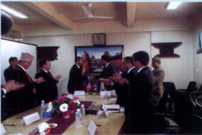
H.E. Mr. Tsend Munkh-Orgil, Minister for Foreign Affairs of Mongolia and Hon'ble Minister for Foreign Affairs of Nepal Dr. Prakash Sharan Mahat signed the Agreement on Visa Exemption