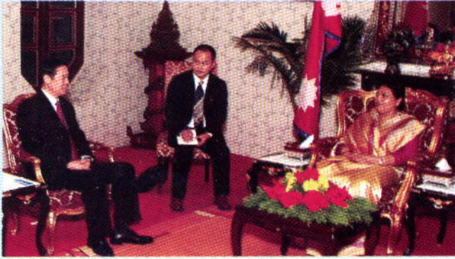
H.E. Mr. Liu Qibao, Political Bureau Member of Communist Party of China and Rt. Hon'ble Mrs. Bidya Devi Bhandari, President of Nepal

Kamal Dahal 'Prachanda', and leaders of political parties of Nepal during his stay in Nepal.