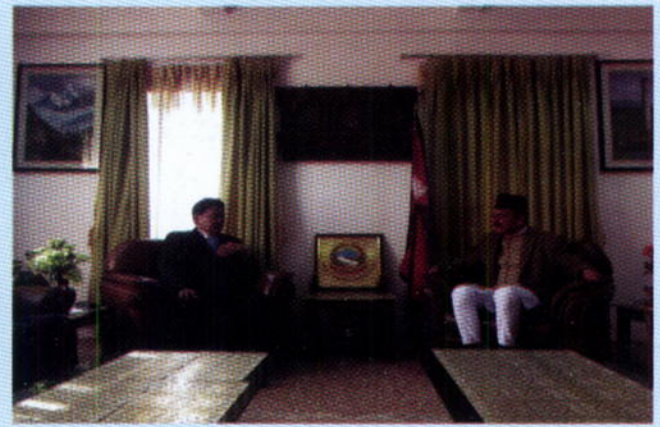
Hon'ble Dr. Prakash Sharan Mahat, Minister for Foreign Affairs of Nepal and H.E. Mr. Biama Chilin, Chairman of the Standing Committee of the People's Congress of TAR, PR China