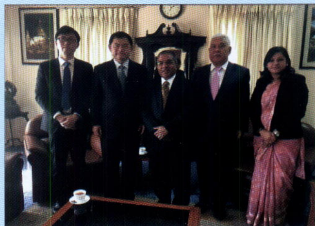
SCO Delegation with Foreign Secretary, Mr. Shanker Das Bairagi

The Deputy Director of the Executive Committee