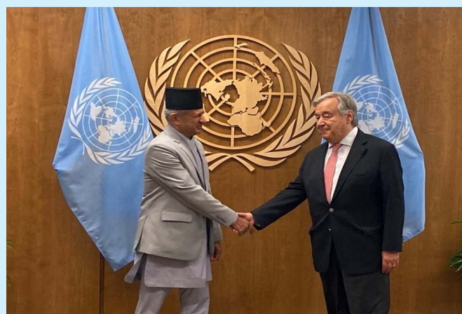
Foreign Minister Pradeep Kumar Gyawali with the UN Secretary General António Guterres Reception in New York

Foreign Minister Gyawali joined State Luncheon hosted by the Secretary-General of the United Nations Mr. António Guterres in honour of visiting Heads of State/Government and Heads of Delegation on 24 September. Foreign Minister Gyawali had a bilateral meeting with the Secretary-General on 30 September and discussed various important matters related to further strengthening Nepal-UN cooperation.