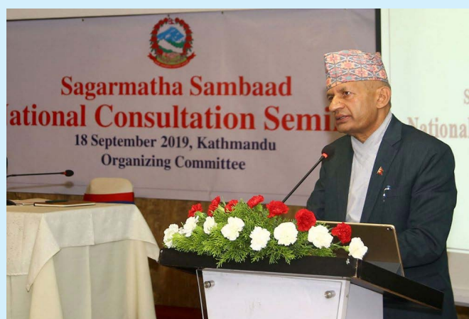
Foreign Minister Mr. Pradeep Kumar Gyawali speaking at Sagarmatha Sambaad National Consultation Seminar, Kathmandu, 18 September 2019