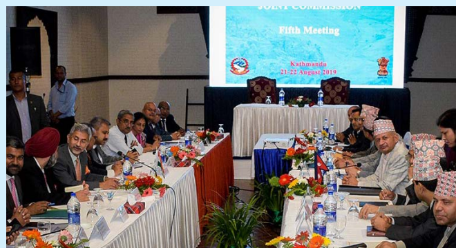
Foreign Minister Mr. Pradeep Kumar Gyawali with External Affairs Minister of India Dr. Subrahmanyam Jaishankar at the 5 th Meeting of Nepal-India Joint Commission

The two Foreign/External Ministers also witnessed the signing of an MOU on food safety between the Department of Food Technology and Quality Control of Nepal and Food Safety and Standards Authority of India.