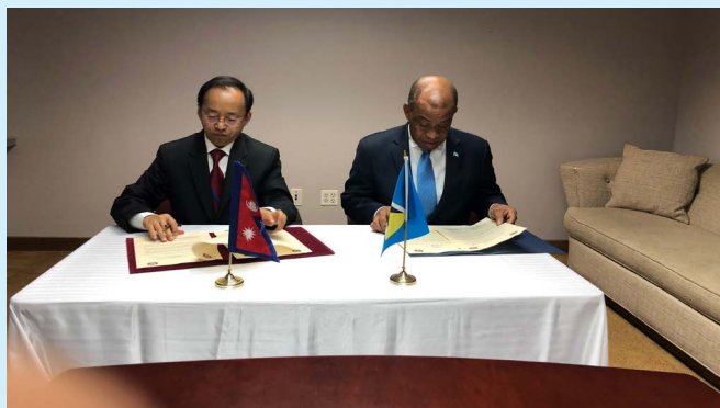
Signing of the Joint Communiqué between Nepal and Saint Lucia