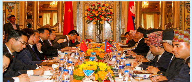
Nepal and China Delegation level bilateral talks, Kathmandu, 09 September 2019

The two Foreign Ministers held delegation level talks where they reviewed all aspects of Nepal-China bilateral relations, and reached understanding to further promote cooperation in various areas of mutual interest.