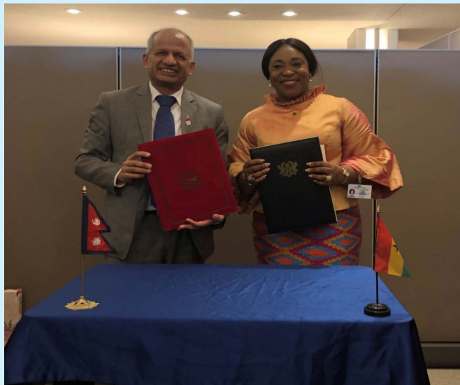
Foreign Ministers of Nepal and Ghana after signing of Joint Communiqué

Nepal and Ghana established formal diplomatic relations on 25 September 2019. Minister for Foreign Affairs Mr. Pradeep Kumar Gyawali and Foreign Minister of Ghana, Ms. Shirley Ayorkor Botchwey signed a Joint Communiqué to this effect. With this, the number of countries that Nepal has established diplomatic relations reached 168. The two Foreign Ministers held bilateral meeting following the signing of the Joint Communiqué.