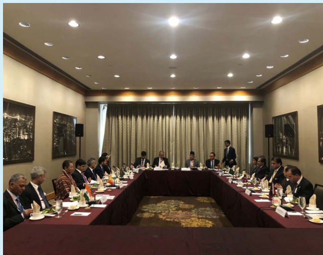
Foreign Minister chairing the Informal Meeting of the SAARC Council of Ministers