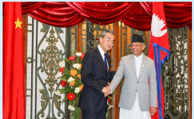
Foreign Minister Pradeep Kumar Gyawali with the State Councilor and Foreign Minister Wang Yi

At the invitation of Minister for Foreign Affairs Mr. Pradeep Kumar Gyawali, State Councilor and Minister of Foreign Affairs of the People's Republic of China Mr. Wang Yi paid an official visit to Nepal from 8 to 10 September.