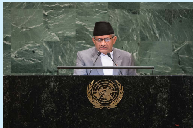
Foreign Minister addressing the 74th Session of the United Nations General Assembly

The Foreign Minister also highlighted Nepal's focus on economic agenda to sustain political gains under an overarching national aspiration of ' Prosperous Nepal, Happy Nepali '. Foreign Minister Gyawali highlighted the disproportionate and unjust burden of climate change on the least developed countries. He informed the decision of the Government of Nepal to convene a global dialogue 'Sagarmatha Sambaad', to deliberate on critical issues facing the world including the climate change.