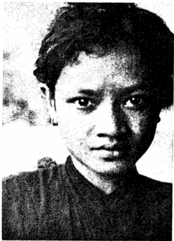
My little girl