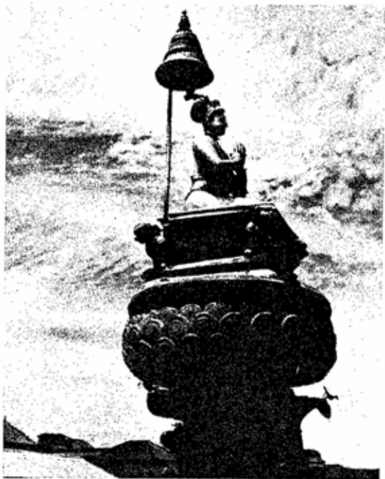
The gold statue of Bhupatindra Mall