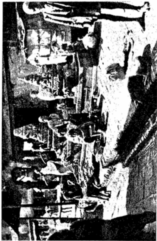
Corner in Khatmandu