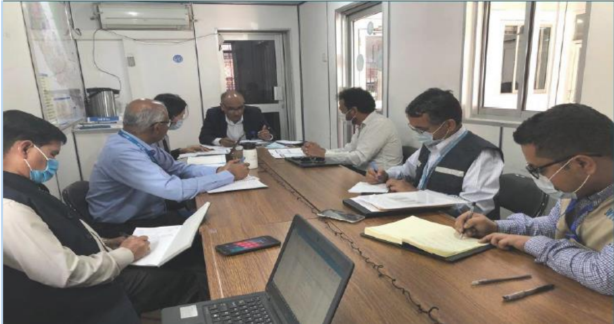
Health cluster coordination meeting via teleconference