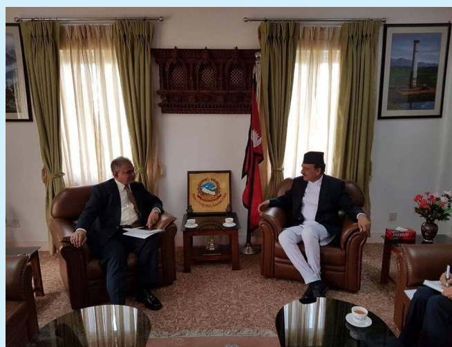
Courtesy Call on Hon. Minister for Foreign Affairs by the SAARC Secretary General on 09 March