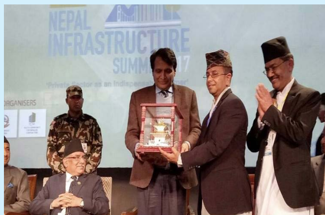
His Excellency Mr. Suresh Prabhakar Prabhu, Minister of Railways of India, receiving a token of love

His Excellency Mr. Suresh Prabhakar Prabhu, Minister of Railways of India visited Nepal to participate in Nepal Infrastructure Summit held on 19-20 February in Kathmandu. Mr. Prabhu, delivering a key note speech as the Guest of Honor at the summit, said that India would create a cross-border railway connectivity as soon as possible in order to connect Kathmandu with two Indian cities — New Delhi and Kolkata. This would not only strengthen cross-border connectivity but also facilitate movement of people of the two countries, he contented.