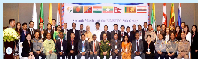
7 th Meeting of the SGLLEI in Yangon, Myanmar

The seventh Meeting of the BIMSTEC Sub-Group on Legal and Law Enforcement Issues (SGLLEI) was held in Yangon, Myanmar on 22-23 March. The Meeting reviewed the progress achieved since the Sixth Meeting of the BIMSTEC sub-group on Legal and Law Enforcement Issues held in New Delhi, India on 17-18 December 2015. It also deliberated on various new areas of cooperation which were considered by the sixth meeting of the BIMSTEC joint working group on counter terrorism and transnational crime held in Sri Lanka. They included the issues such as extradition, cyber crimes and payment devices fraud, trafficking in persons, especially women and children, transfer of sentenced persons, trafficking and trading of illicit firearms, ammunitions and explosives, fake drugs and medicines, among others.