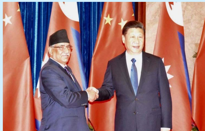
Rt. Hon'ble Prime Minister Pushpa Kamal Dahal shakes hands with the Chinese President H.E. XI Jinping