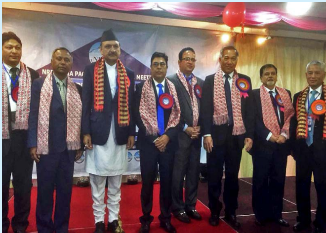
Minister for Foreign Affairs Hon. Dr. Prakash Sharan Mahat with the participants of the meeting

Addressing the event, Hon'ble Minister said that skills, technology and capital of the NRNs spread across the globe could be a huge asset for Nepal to usher into the path of development and prosperity. He appreciated the NRNs' accomplishments across the globe and urged them to further contribute to Nepal's development efforts.