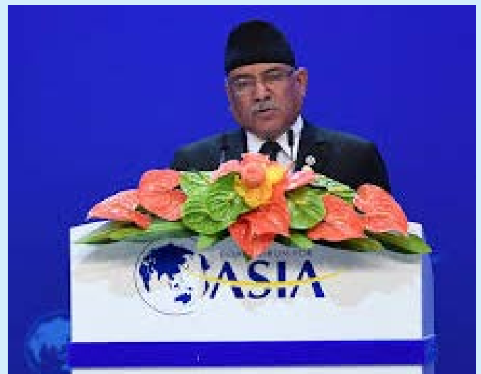
Rt. Hon'ble Prime Minister Pushpa Kamal Dahal 'Prachanda' addressing the Boao Forum for Asia in Boao, China

The Rt. Hon'ble Prime Minister Pushpa Kamal Dahal 'Prachanda' paid a state visit to the People's Republic of China on 23-29 March. During the visit, the Prime Minister attended the Opening Session of the 2017 Annual Conference of the Boao Forum for Asia held in Boao and addressed the forum on "Globalization and Free Trade: Asian Perspectives" on 25 March. He stressed the need of making globalization more inclusive and reinvigorated so as to ensure equitable benefits to all countries. Highlighting the case of the LDCs and LLDCs like Nepal, the Prime Minister called for greater market access opportunities through the implementation of duty free quota free (DFQF) provisions, simplification of rules and procedures, enhancement of capacities and the smooth provision of transit arrangements to enable them to reap benefits of globalization. During his stay in Boao, the Prime Minister had a meeting with His Excellency Mr. Zhang Gaoli, Vice Premier of the People's Republic of China. Matters of mutual interests were discussed in the meeting.