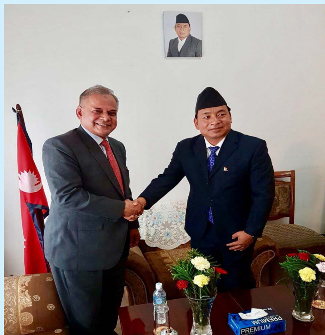
Courtesy Call on Rt. Hon'ble Vice President of Nepal Mr. Nanda Bahadur Pun by the SAARC Secretary General