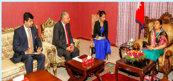
Courtesy Call on Rt. Hon'ble President of Nepal Mrs. Bidya Devi Bhandari by the SAARC Secretary General

After his arrival in Kathmandu the Secretary General paid courtesy calls on high level dignitaries of Nepal including Rt. Hon'ble President, Rt. Hon'ble Vice President and Hon'ble Foreign Minister.