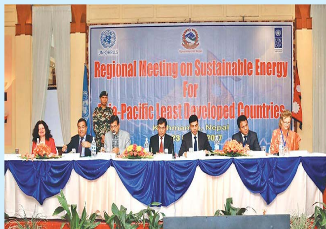
Participants at the Opening Session of the Regional Meeting of the Asia-Pacific Least Developed Countries on Sustainable Energy, 22 March