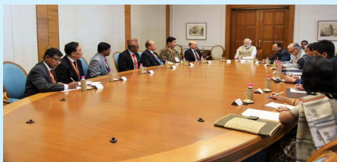
Delegates of the First Meeting of the National Security Chiefs of BIMSTEC Member States jointly called on His Excellency Sri Narendra Modi, Prime Minister of India

In pursuance to the decisions taken at the BIMSTEC Leaders' Retreat held at Goa, India on 16 October 2016, the First Meeting of the National Security Chiefs (NSCs) of the BIMSTEC Member States was held in New Delhi, India on 21 March 2017. Representatives of all the BIMSTEC Member States were present in the Meeting.