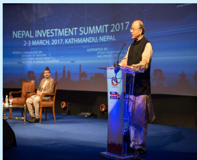
Indian Finance Minister Mr. Arun Jaitley addressing the Nepal Investment Summit,

His Excellency Mr. Arun Jaitley, Minister of Finance of India visited Nepal to participate in the Nepal Investment Summit held in Kathmandu on 2-3 March. Delivering a keynote speech at the summit as the Guest of Honor, Mr. Jaitley said that India was firmly committed to partner with Nepal for accelerating economic growth attracting domestic and foreign investment. Ministry of Industry, Nepal Investment Board and National Planning Commission had jointly organized the Nepal Investment Summit.