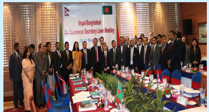
Nepal Bangladesh Commerce Secretary Level Meeting