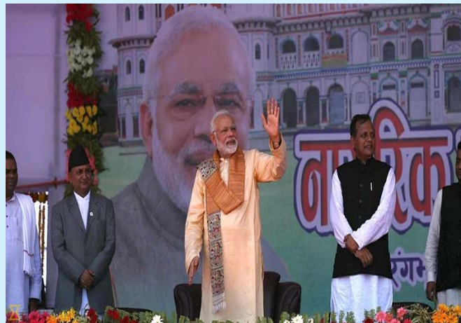
Prime Minister Modi in Civic Reception at Janakpur

Prime Minister Modi also visited Janakpur, Muktinath and Pashupatinath. He attended civic receptions in Kathmandu and Janakpur.