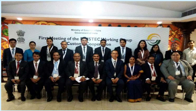
Participants of BIMSTEC Working Group on Custom Cooperation

The First Meeting of the BIMSTEC Working Group on Customs Cooperation was held in New Delhi, India on 10-11 May. Delegations from all the BIMSTEC Member States attended the meeting.