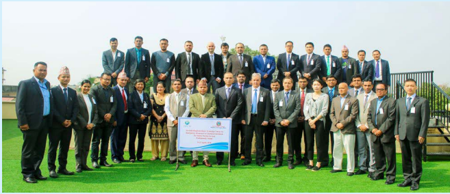
Participants of the Training Programme on 'Emergency Response to Chemical Incidents'

MoFA, in collaboration with Organization for the Prohibition of Chemical Weapons (OPCW), hosted the 7th Regional Training Course on Emergency Response to Chemical Incidents for State Parties in Asia from 9-13 April. More than 30 participants from different countries participated in the programme.