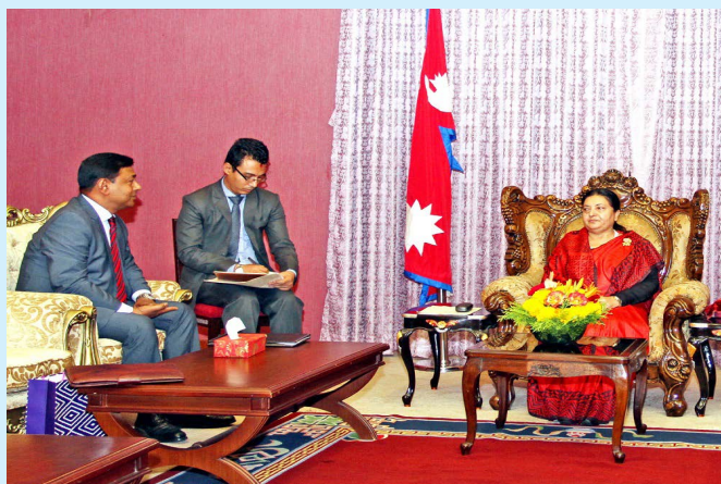
BIMSTEC Secretary General meets Mrs. Bidya Devi Bhandari, the President of Nepal