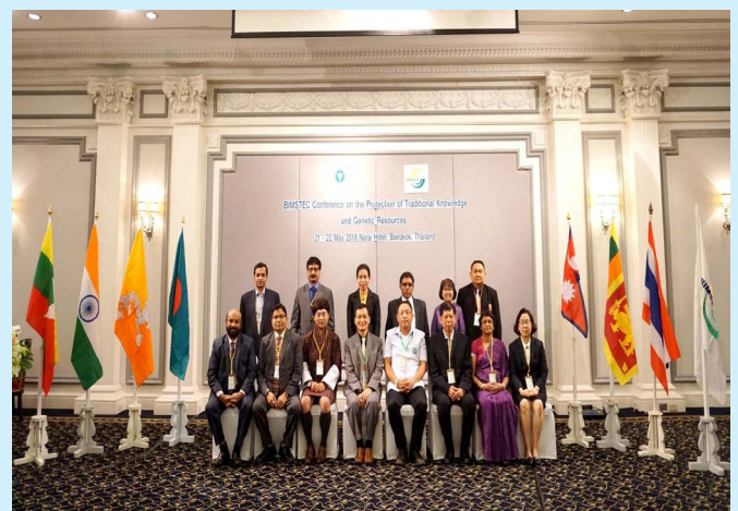
Participants of BIMSTEC Conference on Protection of Traditional Knowledge and Genetic Resources

The meeting also agreed to update the current situation on the protection of Genetic Resources (GR) and associated Traditional Knowledge (TK). The Conference agreed the proposal of Thailand to prepare a concept paper on the protection of genetic resources associated with traditional medicine knowledge and Intellectual Property Rights (IPR) for the BIMSTEC to be submitted to the secretariat and circulated by the latter for the concurrence of the member States.