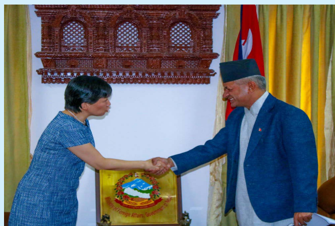
UN Under Secretary Meets Minister for Foreign Affairs of Nepal