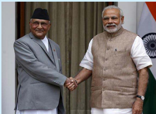
The Prime Minister Oli with the Prime Minister Modi

At the invitation of the Prime Minister of Nepal, Mr. K.P. Sharma Oli, Shri Narendra Modi, the Prime Minister of India paid a state visit to Nepal on 11-12 May.