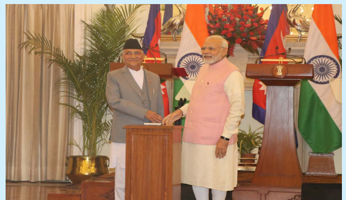
Prime Minister of Nepal with Prime Minister of India

The Prime Minister of Nepal interacted with the intellectual community at a civic reception hosted by the India Foundation.