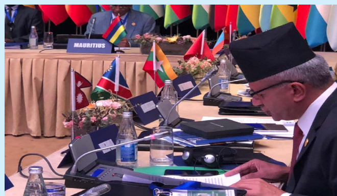
Minister for Foreign Affairs of Nepal addressing NAM Ministerial Conference in Baku

Nepal was elected as Vice-Chair of the Ministerial Conference representing the Asia-Pacific region. The Foreign Minister highlighted the continued relevance of NAM's principles and also underlined the necessity of solidarity among NAM countries on the current global issues.