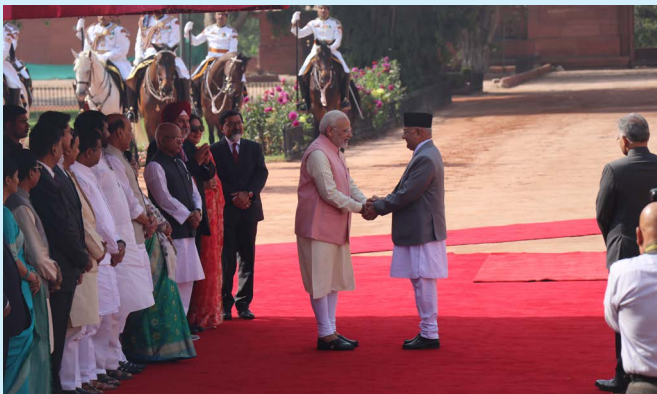
The Prime Minister of Nepal with the Prime Minister of India at the Rashtrapati Bhawan of India

The Prime Minister of Nepal Mr. K.P. Sharma Oli paid a state visit to India on 6-8 April at the invitation of Shri Narendra Modi, the Prime Minister of India. The entourage of the Prime Minister included Mr. Pradeep Kumar Gyawali, Minister for Foreign Affairs, Mr. Matrika Prasad Yadav, Minister for Industry, Commerce and Supplies, Mr. Raghubir Mahaseth, Minister for Physical Infrastructure and Transport, Mr. Bishnu Prasad Rimal, Chief Advisor to the Prime Minister, Members of Parliament, Chief Secretary, Secretaries and other high-ranking officials of the Government of Nepal.