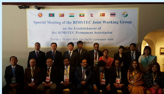
Members of BIMSTEC Joint Working Group