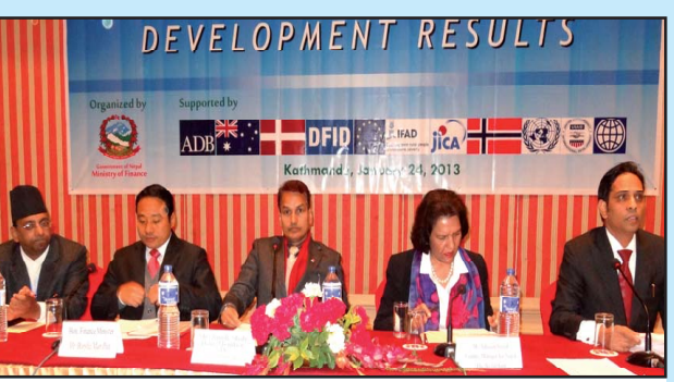
From left: Finance Secretary, Hon. Finance Minister, Hon. Member NPC, WB Country Manager and IECCD Chief

Editorial 2 Agreement with Asian Development Bank 2 3 NPPR meeting, 2012-Event gallery Agreement with the World Bank 4 Loan Negotiations 4 IFAD - Nepal CPE workshop 4 ADB Vice President Mr. Lohani Meets Hon. Finance Minister 4 Piper Makes Farewell Call on FM 5 CPS Consultation Meeting with Korean Delegates 5 GoN, UNDP sign Country Program Action Plan for 2013-2017 5 GoN, UNFPA sign Country Program Action Plan for 2013-2017 6 GoN, UNICEF sign Country Program Action Plan for 2013-2017 6 Foreign Aid Commitment 6 Nepal-Finland Country Consultation Meeting 6