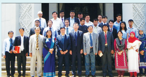
Representatives from Nepal and other Countries

to capture the NGOs data. However, the ODA database is controlled by Council for the Development of Cambodia (CDC), not by Finance Ministry and the focal person of DPs and NGOs are responsible for data entry of the related projects. The team also had chance to learn about the homegrown aid management database of Bangladesh.