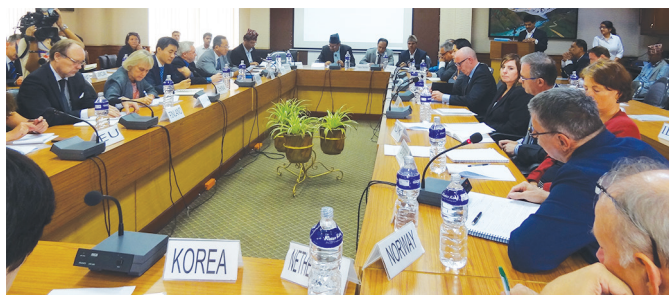
A Glimpse of DPs Meeting