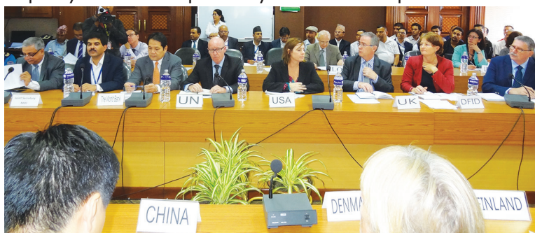
A Glimpse of DPs Meeting