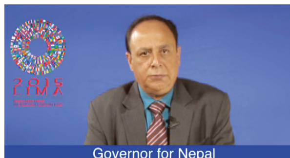
Governor for Nepal