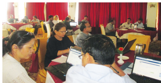
AMP Training Participants

For the purpose of aid transparency and aid predictability, the Aid Management Platform (AMP), an online web-based information system is set up in the Ministry of Finance. All development partners have been given access to this and they are reporting aid