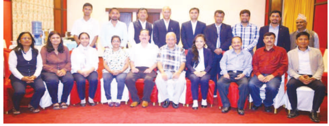
Glimpse of Negotiation Skill Training Participants

also in our daily lives. The training was tailored to the needs of concerned GoN officials to improve national capacity to negotiate and manage external resources in a more efficient way.