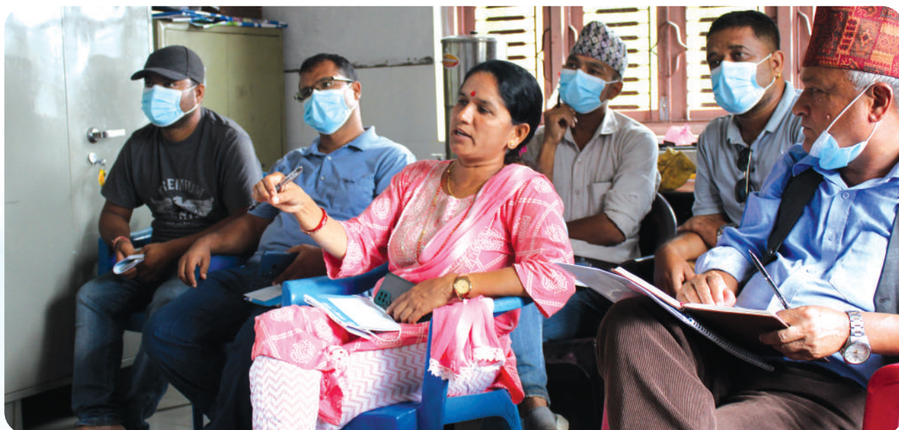
A consultation to address grievances of PAPs at Hetauda Sub-Metropolitan City, Makwanpur.