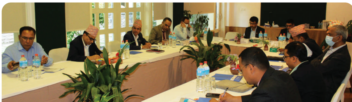
CDOs from five project-affected districts attending the workshop at Dhulikhel Municipality on 20 June 2023.