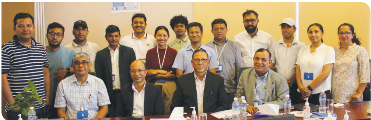
Participants at the closing ceremony of a training on International Roughness Index (IRI) Class 1 Equipment organized on 12 June 2023.