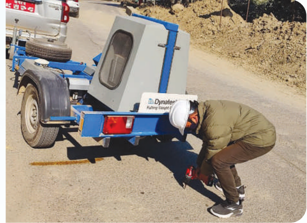
Team from DoR measuring pavement deflection at Dhan Khola to Lamahi section using a FWD.