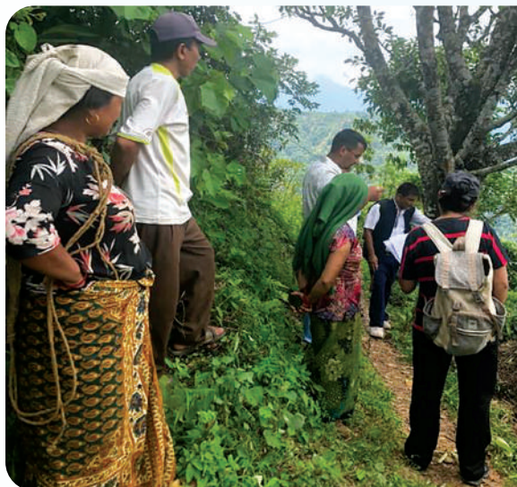
PAPs discussing the tower location during 30km walkover survey at Rishing Rural Municipality, Tanahun.

MCA-Nepal launched a bid for Supervision Engineers on 18 January 2023. MCA-Nepal presented the overall scope of work along with the administrative requirements of contracts to prospective companies in a pre-bid meeting organized prior to the submission of bids. A total of 13 companies submitted their proposals for the assignment.