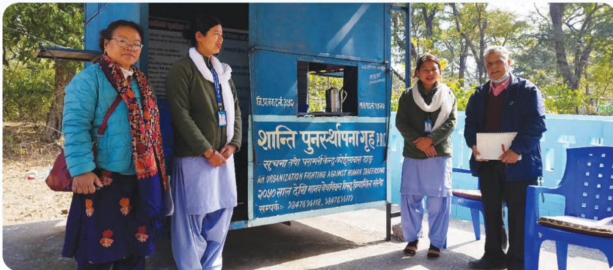
MCA-Nepal team in Peace Rehabilitation Centre Check Point in Koilabas Border Area, Dang.

MCA-Nepal rolled out the Anti-Sexual Harassment Policy applicable to its staff and Consultants during the year. The team of Ratmate S/S LRP implementation Consultant SAPPROS Nepal including board members and management team were also trained on Prevention of Sexual Harassment at Workplace.