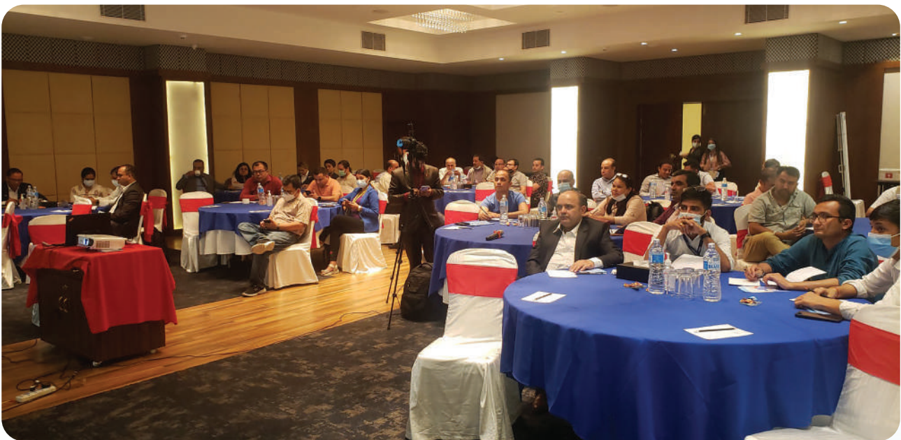
Media representatives participating in an informative and interactive session, organized by MCA-Nepal to share information on the status of MCC Nepal Compact projects, its fiscal and procurement procedures/systems and the timeline for implementation on 18 August 2022.