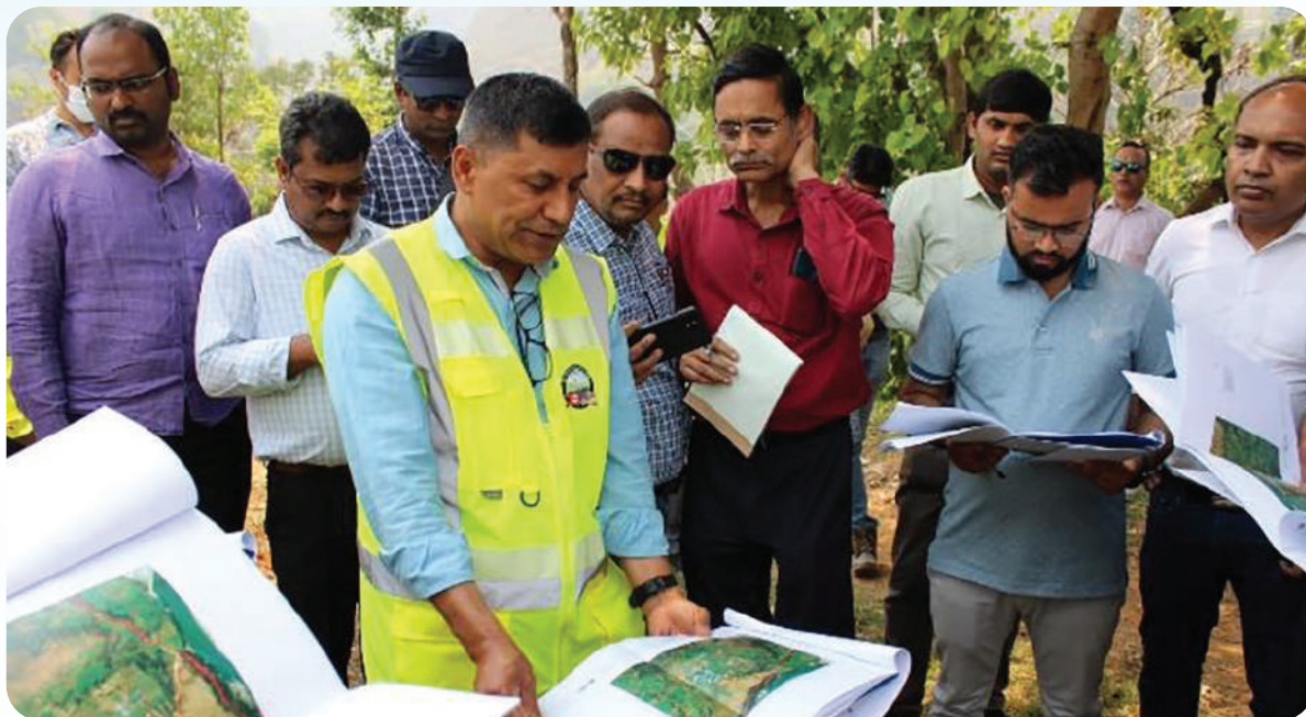
Site visit to orient prospective bidders on the locations for the design and build of Substations.