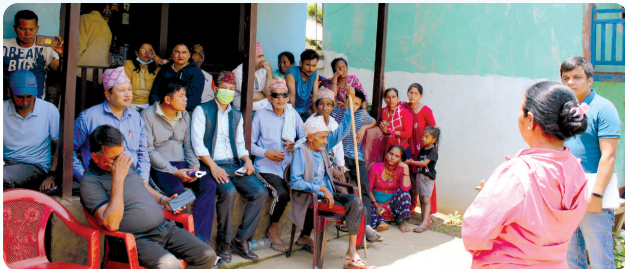
A consultation event at Ghiring RM-1, Atrauli, Tanahun to address grievances of PAPs in the presence of the Assistant CDO of Tanahun and Deputy Chairperson of the RM.