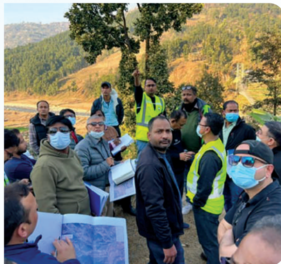
Prospective TL bidders being briefed during the site visit at Panchakanya Rural Municipality, Nuwakot.

The Substations Activity includes the design, supply, construction, installation, testing and commissioning of three new 400 kV indoor Gas-Insulated Substations (GIS). Among the three, the Ratmate S/S will be constructed in Belkotgadhi Municipality of Nuwakot District, the New Damauli S/S in Damauli of Tanahun District, and the New Butwal S/S at Bhumahi of Nawalparasi (Bardaghat Susta West) District. Apart from these three substations, the transmission lines will also terminate at two additional substations under construction by NEA at Lapsipedi in Kathmandu District and Hetauda in Makwanpur District. Technical details of the three new S/S are listed below: