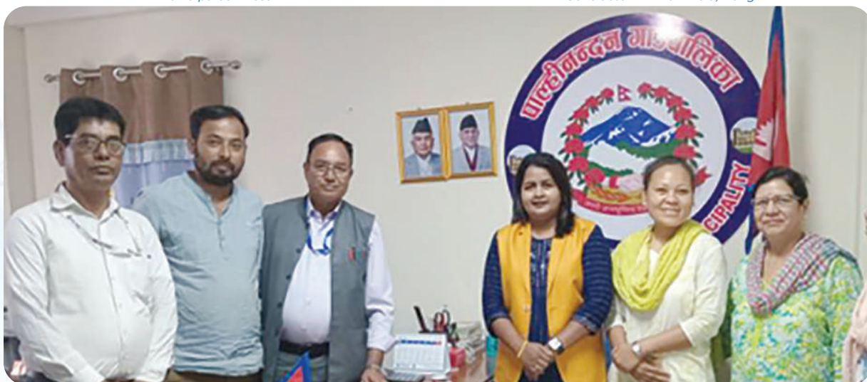
MCA-Nepal team with the Vice Chair of Palhinandan Rural Municipality, Nawalparasi Bardaghat Susta West.