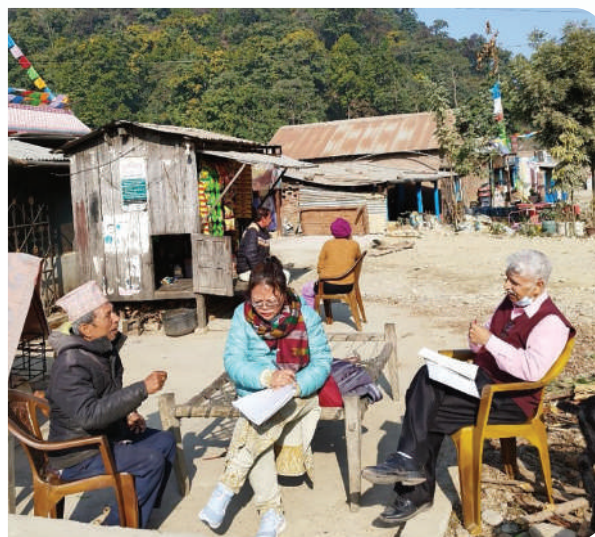
Key Informant Interview (KII) with Road Construction Petty Contractor in Dhankhola, Dang.