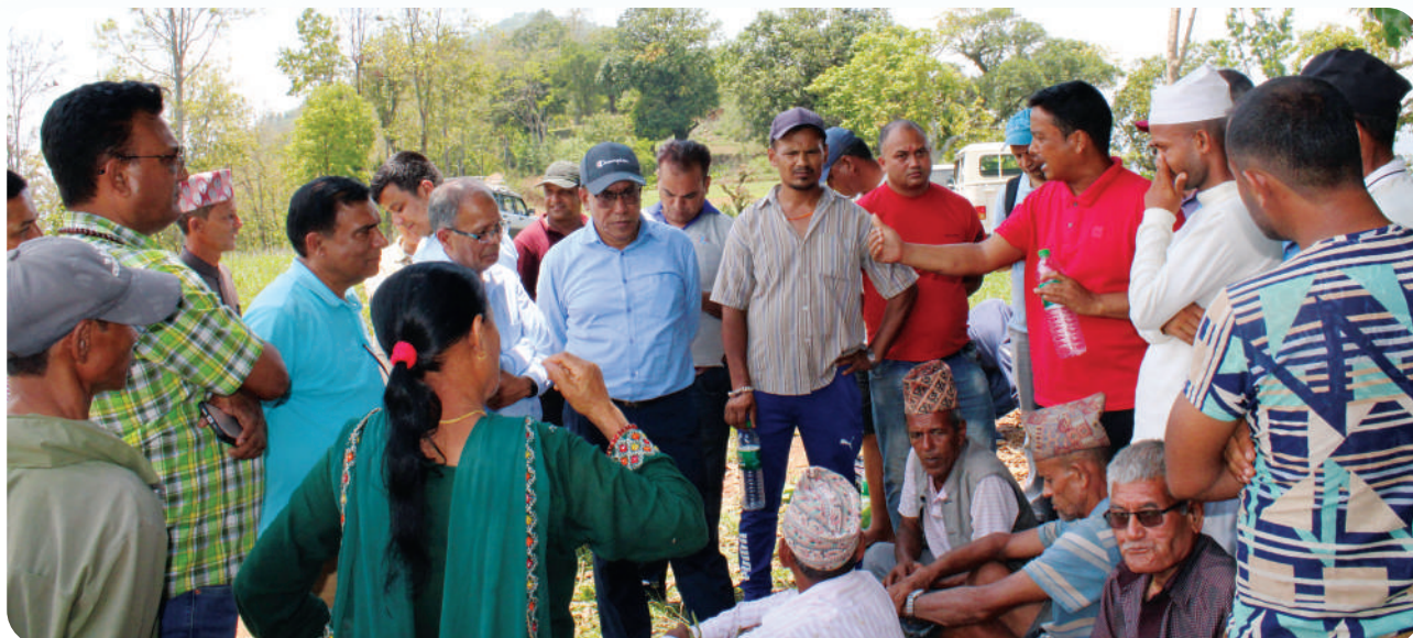
A consultation event organized at Likhu RM-5, Nuwakot to address grievances of PAPs.