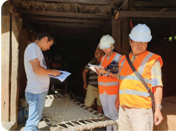
MCA-Nepal conducting asset verification survey with local people along the Dhan Khola to Lamahi section in Dang district.