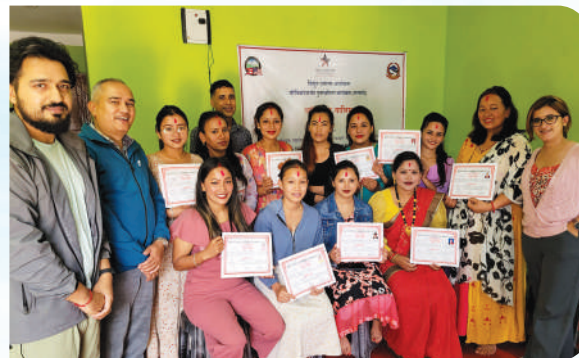
Participants of Beautician Training.