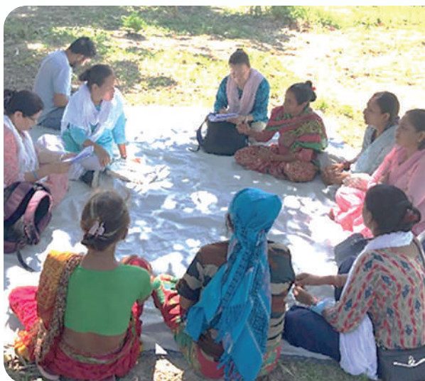
Focus Group Discussion with women PAPs at Gheudalla, Nawalparasi West.