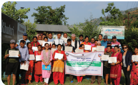
Participants of Commercial Agriculture and Animal Husbandry Training.