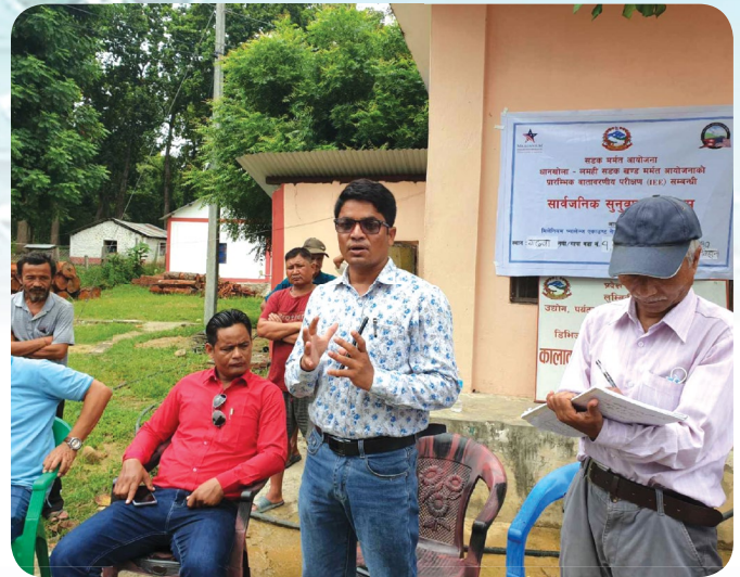
Public hearing conducted at Kalakate, Gadawa Rural Municipality of Dang district as a part of the Initial Environmental Examination (IEE) under Road Maintenance Project.

MCA-Nepal organized public hearing events in Dang district as a part of the Initial Environmental Examination (IEE) under its Road Maintenance Project to upgrade and maintain the 40 km road section from Dhankola to Lamahi from 26-28 August 2022.