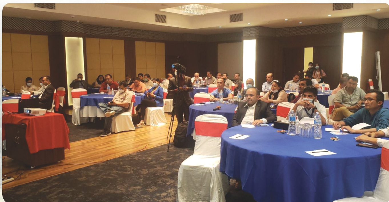
Media representatives participating in the interactive session.

43 journalists representing various media took part and had the opportunity to present their questions and acquire facts on the MCC Nepal Compact in the half-day session.