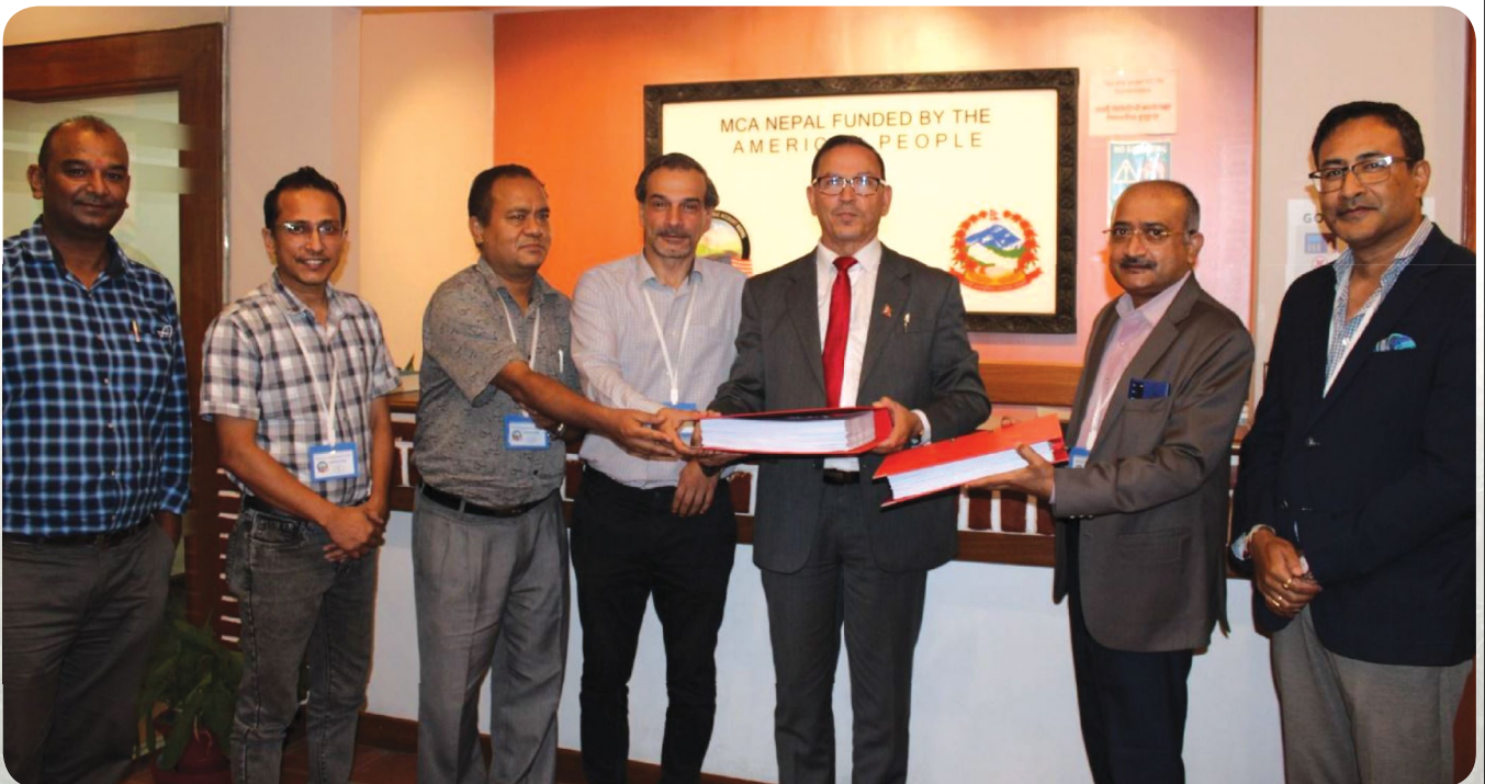
Exchange of the contract on consulting services for the preparation and implementation of the Resettlement Action Plan (RAP) and Livelihood Restoration Program (LRP).

A contract for consulting services required for the preparation and implementation of the Resettlement Action Plan (RAP) and Livelihood Restoration Program (LRP) for the transmission lines to be built by MCA-Nepal was signed with