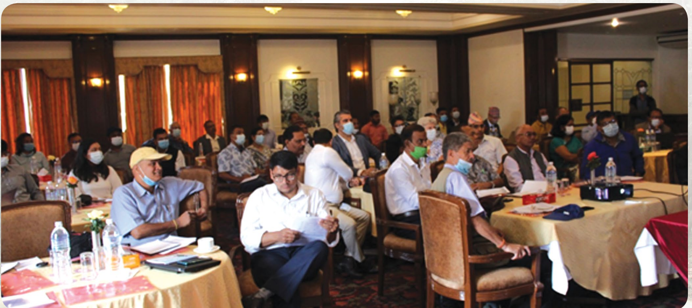
Participants in the kick-off meeting for the preparation and implementation of the Resettlement Action Plan (RAP) and Livelihood Restoration Program (LRP) of the transmission lines organized in Kathmandu on 21 September 2022.

been selected for preparation and implementation of the RAP and LRP activities to avoid and/or minimize any adverse involuntary resettlement and livelihood impacts on the project-affected people in 10 districts of Nepal.