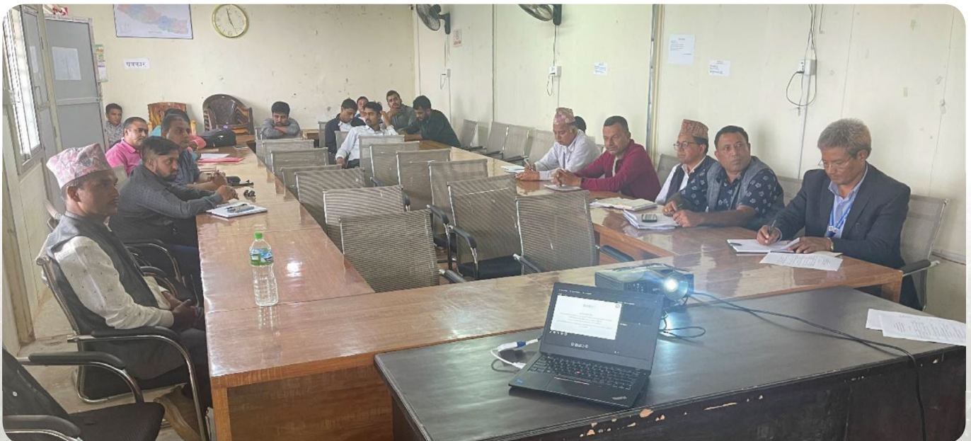
Participants at the District-Level Inception Meeting for the Ratmate Livelihood Restoration Program (LRP) Implementation organized in Bidur Municipality, Nuwakot on 11 July 2022.

A district-Level Inception Meeting for the Ratmate Livelihood Restoration Program (LRP) Implementation was organized in Bidur Municipality, Nuwakot on 11 July 2022.