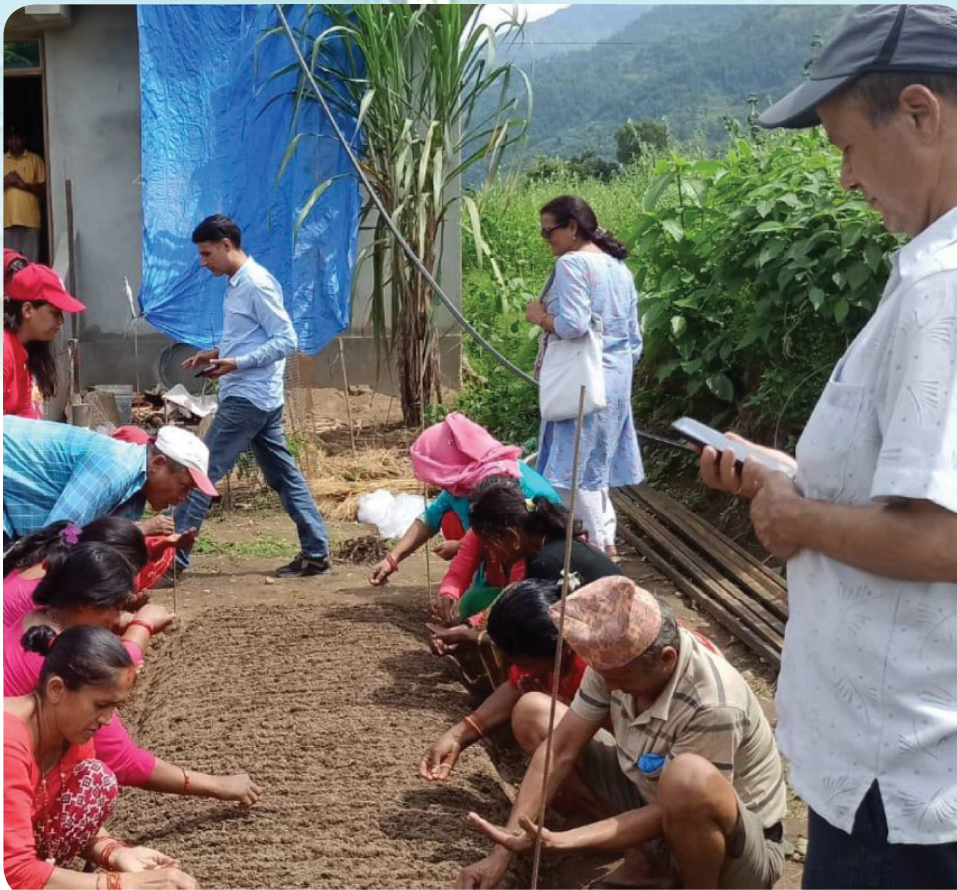
Training on commercial farming of off-season vegetables for project affected persons in Belkotgadhi-7 Nuwakot from 4 to 6 September 2022.

As a part of the Livelihood Restoration Program (LRP), MCA-Nepal conducted training on commercial farming for Project Affected Persons in Belkotgadhi-7 Nuwakot, the construction site of 400 kV Substation.