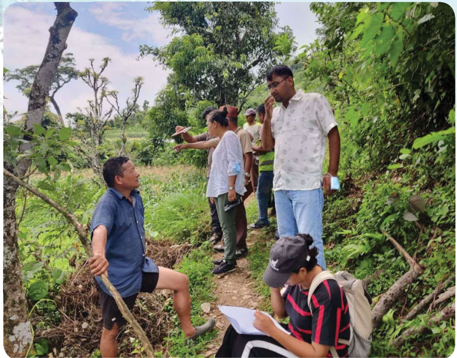
MCA-Nepal team conducting a walkover survey in an approximately 30 km area of the proposed transmission line route.

Based on the survey findings, alternative routes will be proposed.