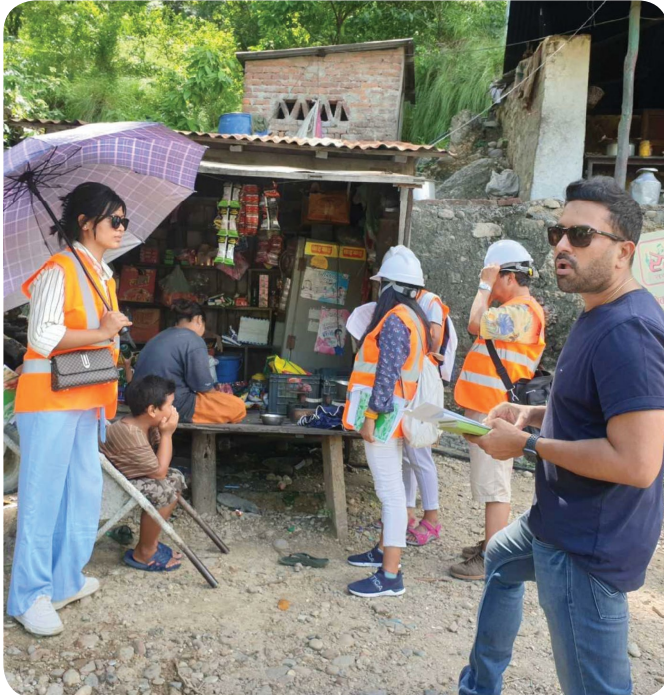
MCA-Nepal and MCC representatives conducting a verification survey to determine the impacts of the Road Maintenance Project along the Dhankhola - Shivakhola section of the East-West highway in Dang.

During the process, MCA-Nepal also conducted consultations with local people to be affected by the project. As per the survey results, 43 private structures will be affected by the project.