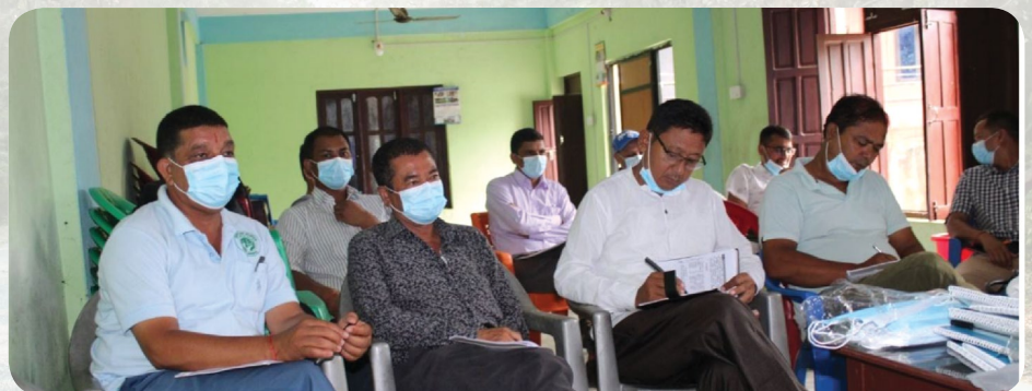
Participants at the ward-level consultation conducted at Ward No. 10 of Hetauda Sub-Metropolitan City on 28 August 2022.