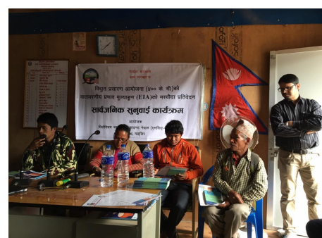
Public hearing in Kailash, Makwanpur