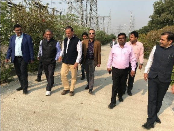
MCA-Nepal team along with MCC during the visit to India with the PGCIL team.