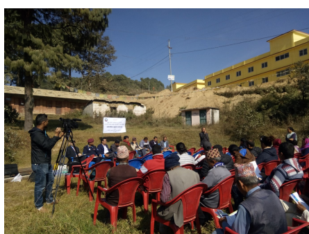
Public hearing in Shankharapur, Kathmandu

MCA-Nepal organized municipality level public hearings from 24 November - 5 December 2019 in all 30 Municipalities of the ten districts which will be affected by the Electricity Transmission Project (ETP) will be implemented. The purpose was to generate awareness of the importance of MCA-Nepal's ETP, share the draft Environment Impact Assessment (EIA) report, sensitize communities and local stakeholders on the potential social and environmental impact of the project activities and share mitigation measures adopted to address them. The EIA was conducted earlier in areas that will be affected, i.e. 98 wards of 30 municipalities. EIAs are carried out to minimize the adverse impacts on ecological, social and the surrounding physical environment. Considering these socio-environmental impacts, several adjustments were made on the alignment route for the transmission towers. The hearing was an opportunity to share how the EIA has adopted various impact mitigation measures, such as compensation based on resettlement cost, compensation for crops, fruits and plants for the transition period. Public hearings are a mandatory requirement in finalizing the environmental impact study of project areas that will be affected by the Electricity Transmission Project. As a result, many of these municipalities have provided their recommendation to move ahead. A total of 1543 people took part in public hearings out of which about 20% of the participants were women.