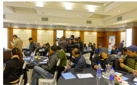
Participants during the Q & A session.