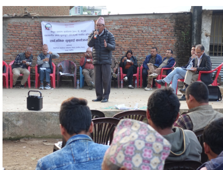
Public hearing in Belkotgadhi, Nuwakot