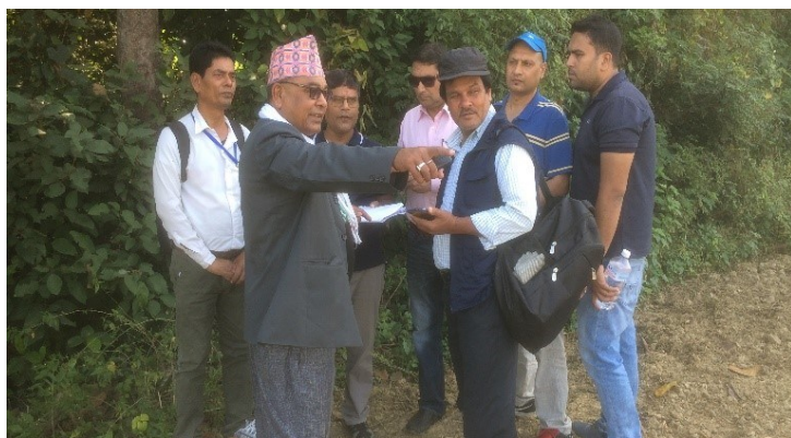
MCA-Nepal team visiting the TL site with the Ward Chair of Ward no. 13 from Sunwal Municipality.

MCA-Nepal team and a consultation group from Stantec visited Parasi District from 7 - 12 November 2019 to consult with local residents, including complainants, municipal representatives and government officials regarding the grievances received and possible solutions. The team also visited the transmission Line path and explored possibilities of alternative routes, evaluated the possible environmental and social impacts due to the proposed changes.