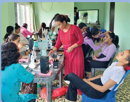
PAPs attending a beautician refresher training.