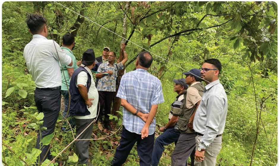
An orientation to lead forest census team organized in Tanahun district.

The activity aimed to document and provide details of forest area; the number of trees that need to be cleared in the community, leasehold and government forests affected by the ETP. Based on the data collected, MCA-Nepal will plan appropriate mitigation measures. The census will be carried out in all ETP implementation districts. Forest census will pave the way for forest clearance during the construction of tower pads for the transmission line.