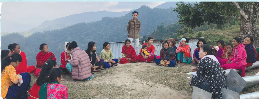
FGDs with project affected women at Kailash Municipality, Makawanpur.

The findings will be documented in the Resettlement Action Plan as well as the safeguarding measures plan accordingly. Similar consultations will be held in all project-affected districts.