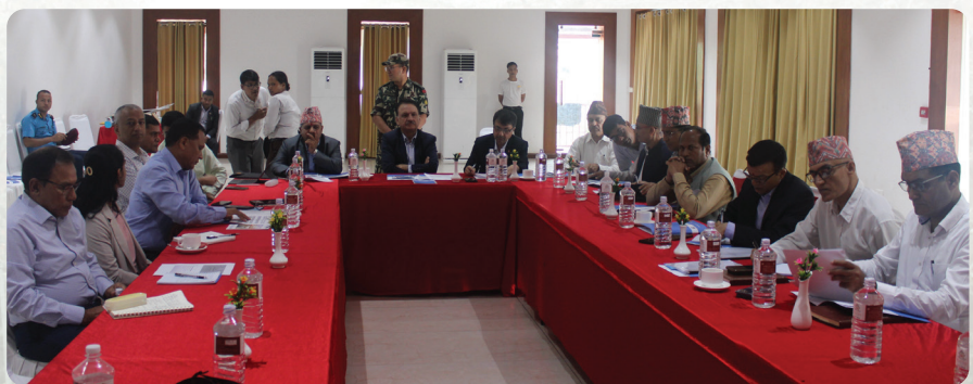
CDOs from ETP districts attending a workshop to facilitate the land acquisition process in Butwal on 24 July 2023.