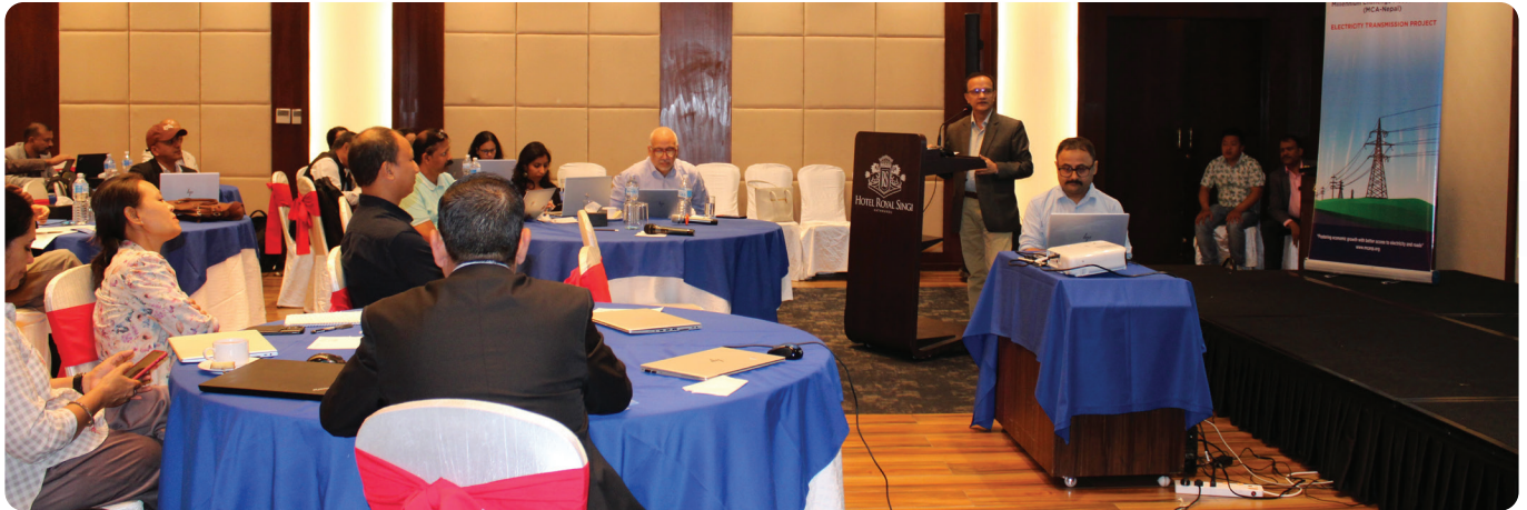
The market outreach event for potential bidders on the MCA Partnership Program (MPP) on 13 October 2023.

This program will help alleviate the risk of project delays and includes three main thematic areas. The focus of the three thematic areas is electricity distribution system augmentation and extension, off-grid/grid solutions for water supply schemes, and capacity building for enhanced electricity use.