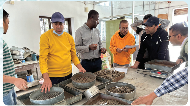
Lab technicians participating in the training on 2023.

A 40km road section from Dhan Khola - Lamahi Road in the East-West Highway has been identified for the activity for which design works are under preparation.