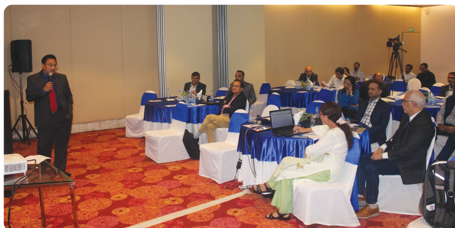
The market outreach event for potential bidders of the upcoming procurements related to the Power Sector Technical Assistance activity organized in New Delhi, India on 8 August 2023.

Pre-proposal Conference for in which 48 participants (interested service providers in person and online) from 20 firms took part.