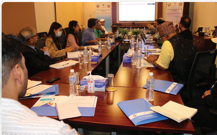
The Pre-proposal Conference for potential bidders of the upcoming procurements related to the Power Sector Technical Assistance activity organized in Kathmandu on 6 October 2023.