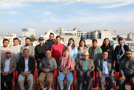
Resource persons and participants of the training on International Roughness Index Class 2 Equipment Installation and Application.

MCA-Nepal organized a training on International Roughness Index Class 2 Equipment Installation and Application for engineers from the Department of Roads (DoR), Institute of Engineering and its Road Maintenance Project (RMP) team from 19 to 22 December 2023 in Kathmandu.