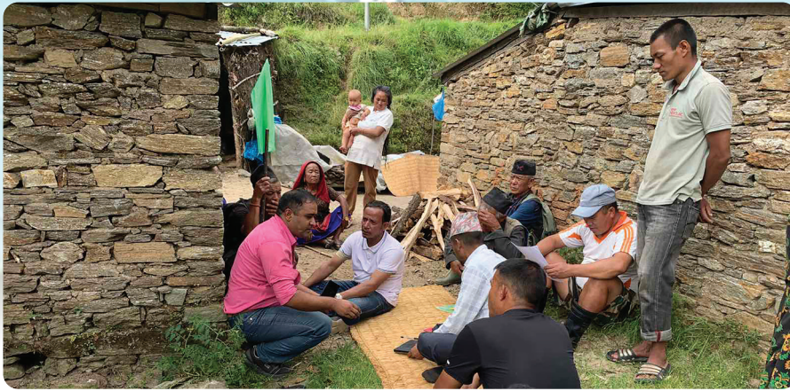
Household survey being conducted in Nuwakot district.

MCA-Nepal has completed household surveys in Chitwan and Nawalparasi (East) districts to obtain sociocultural, demographic and economic information on project-affected families. Household surveys are ongoing in Dhading, Makwanpur, Nawalparasi (Bardaghat Susta West), Nuwakot, Palpa and Sindhupalchowk districts.