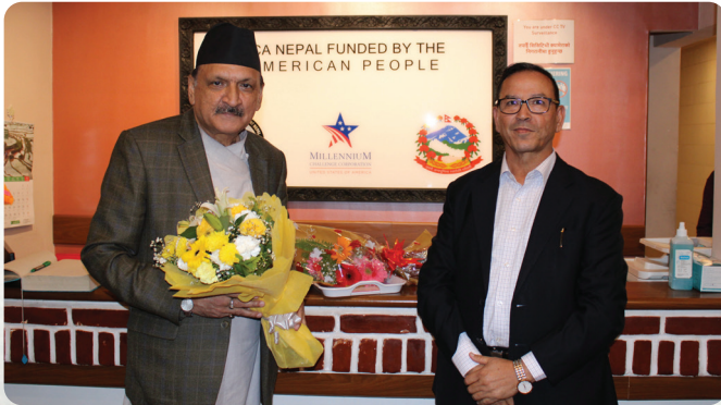
Finance Minister Dr. Prakash Sharan Mahat visited the MCA-Nepal office on 13 July 2023.

MCA-Nepal also hosted high level representatives from the Government of Nepal and U.S. Government prior to and after the launch of the MCC Nepal Compact.