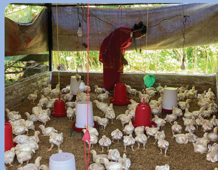
A PAP trained in poultry training attends to her chickens in her farm.