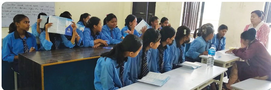
FGDs with project affected school children in Hetauda Sub Metropolitan City, Makawanpur.