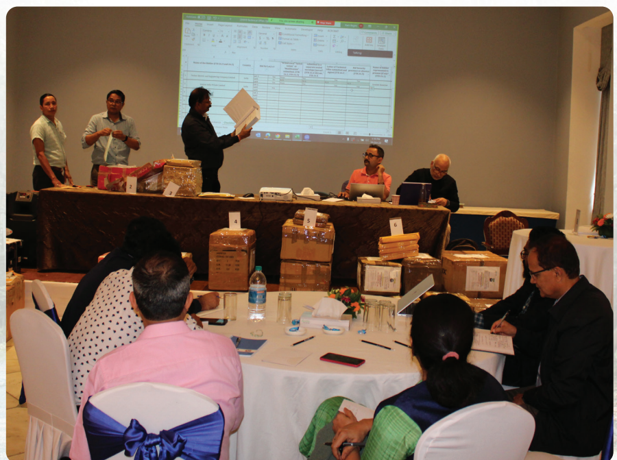
The bid opening event for the construction of three Substations conducted on 19 October 2023.

As next steps, MCA-Nepal will evaluate the technical and financial proposals of submitted bids to initiate the construction works for three substations in the coming months.