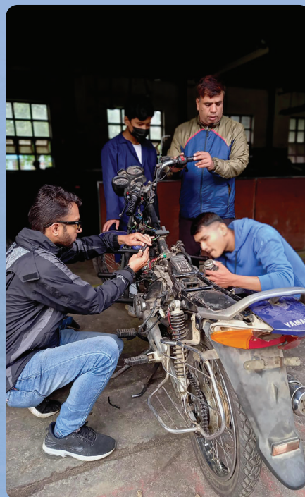
PAPs in a practical session under automobile mechanic training.