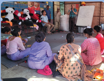
Business plan orientation for PAPs trained in doll and cushion

Some glimpses of activities carried out under LRP: