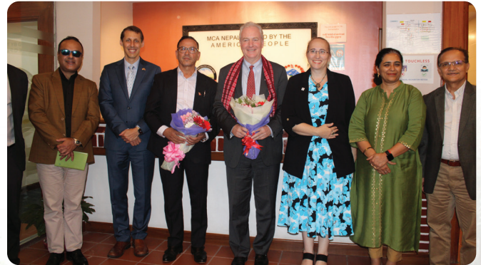
Senator Mr. Chris Van Hollen from Maryland, US, visited the MCA-Nepal office on 1 September 2023.