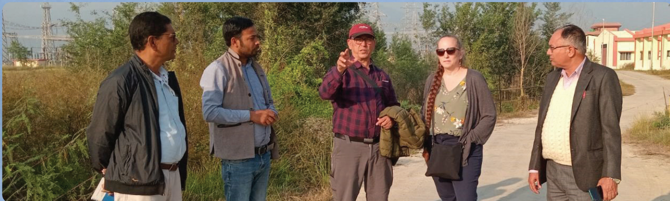
MCA-Nepal and MCC teams at the New Butwal Substation construction site on 30 November 2023.

visited the construction site of New Butwal Substation at Sunwal Municipality of Nawalparasi (Bardaghat Susta West) District on 30 November 2023 as part of the regular project activity.