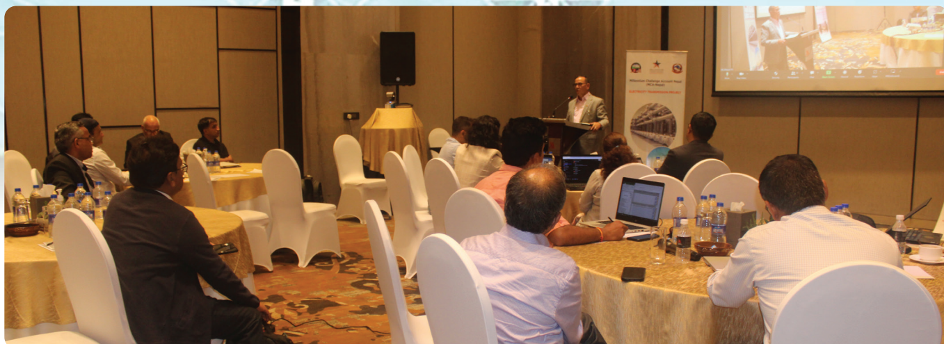
The market outreach event for potential bidders of the upcoming procurements related to the Power Sector Technical Assistance activity organized in Kathmandu on 1 August 2023.

MCA-Nepal organized a market outreach event in New Delhi, India on 8 August 2023 for potential bidders of the upcoming procurements related to the Power Sector Technical Assistance (TA) activity under the ETP.