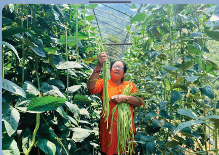
A PAP trained in commercial agriculture harvesting her produce.