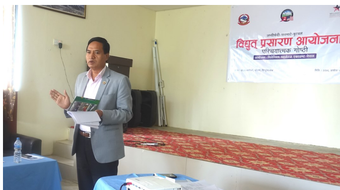
Member of Parliament and former Minister for Law and Justice Mr. Sher Bahadur Tamang explaining the compact to the audience.

On 22 September 2019, MCA-Nepal organized a district-level consultation program on Electricity Transmission Project (ETP) in Chautara of Sindhupalchowk District. Around 40 people took part in the event including local government officials, elected representatives and the media.