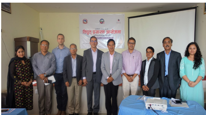
MCA-Nepal & MCC staff with MP Sher Bdr. Tamang after the event.

Sindhupalchowk is one of the ten districts that will be affected by the electricity transmission line project. Out of 318 km of 400 kV transmission line, 10 km will pass through four wards ( Wards no 1, 2, 3 and 4) of Melamchi Municipality in the district, and 37 towers will be built for the same purpose in the district. In total, seven public/private structures, 11.55 hectares of forest land and 34.81 hectares of private land are projected to be affected during the implementation of the project in the district.