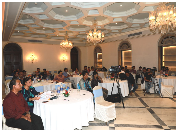
Participants at the press meet.

Addressing questions related to the Conditions Precedent raised by participating journalists, he said, "The CPs are the conditions set forth by the Compact that must be met by the GoN for the implementation phase to begin."