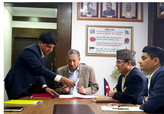
Honorable Minister of Finance, Dr. Yubaraj Khatiwada, signing the PIA at the Ministry of Finance.

With its signing, Nepal has met one of the key Conditions Precedent to the 30 June 2020 Entry Into Force date after which the five year clock to implementation of the Compact will start. In September 2017, MCC signed the Compact with the Government of Nepal. The Compact aims to increase the availability and reliability of electricity, improve the quality of the roads network and facilitate power trade between Nepal and India – helping to spur investments and accelerate economic growth that will benefit all Nepalese. Read the full PIA at our MCA-Nepal website here .