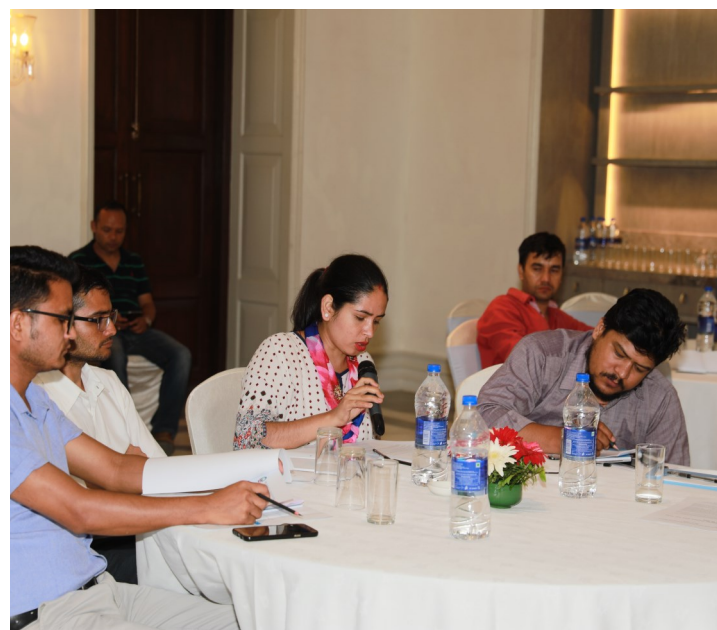
Journalists participating during the Q&A session.

We have already met some of the conditions while some are remaining. Site access to all project construction sites with Environmental Impact Assessment (EIA) approval, land acquisition and forest clearance are in progress."