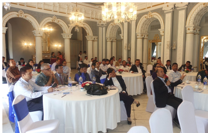
Participants at the Road Maintenance Project kick-off meet.