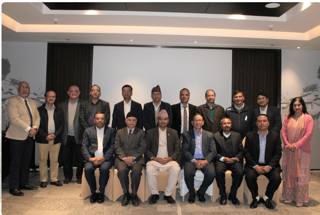
Participants and resource persons at the orientation.

the Ministry of Finance and the Chairperson of MCA-Nepal Board, shared that the MCC Nepal Compact will contribute significantly to the infrastructure development of Nepal, and the Government of Nepal was committed to its successful implementation.