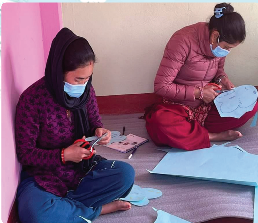
Participants at the two-month long Doll and Cushion Making Training

Furthermore, MCA-Nepal conducted a one-day training on the Prevention of Sexual Exploitation, Harassment and Abuse for SAPPROS board members, senior management team members, staff and the LRP implementation team on 26 December 2022.