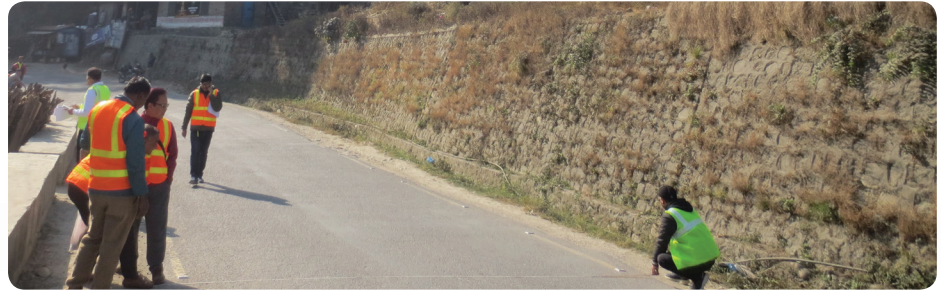
MCA-Nepal team conducting an asset verification and socio-economic survey.