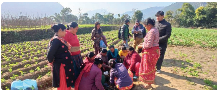
Project affected people attending the practical session of the training.