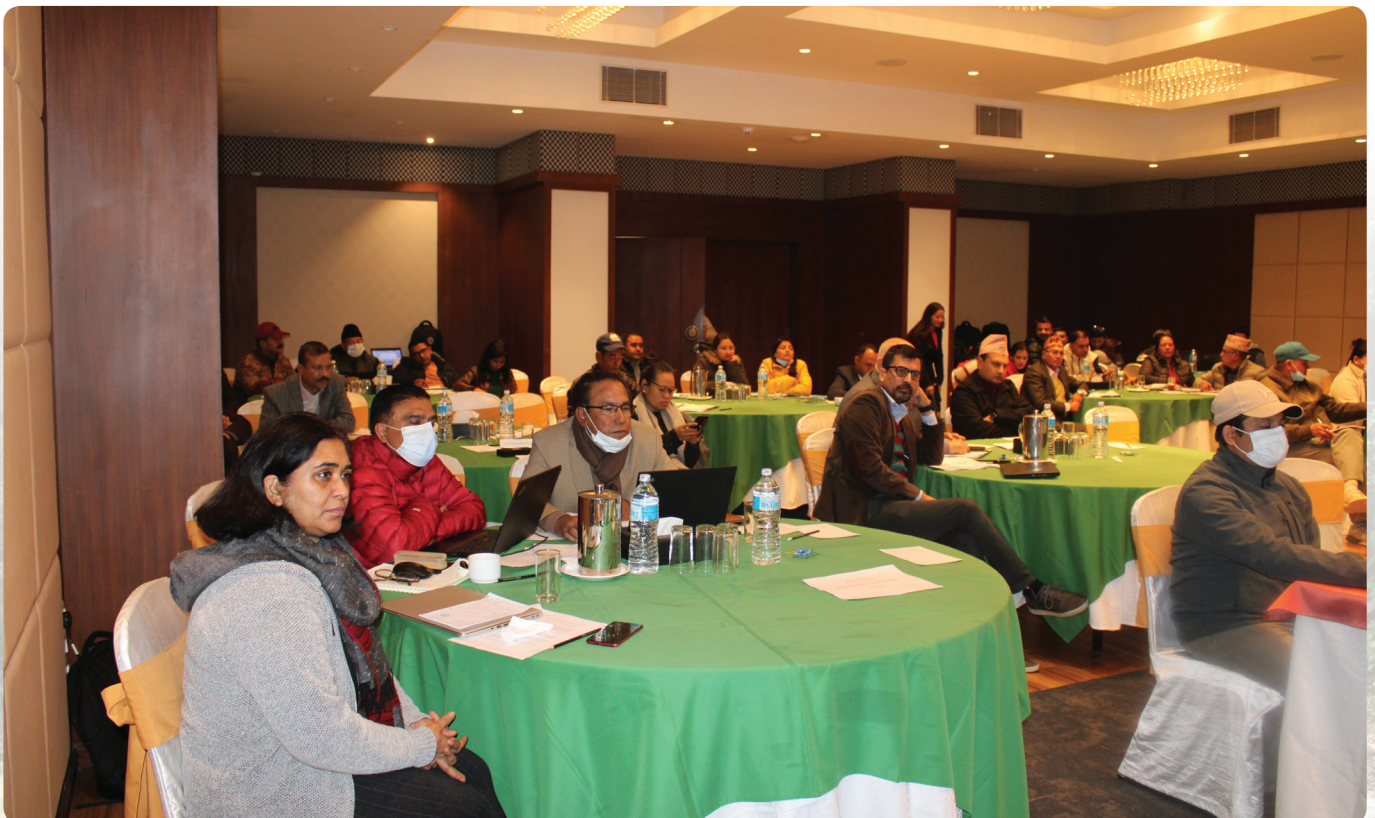
Participants at the Inception Workshop.

Ltd was selected to provide consultancy services for the preparation and implementation of TL RAP and LRP. The activities under RAP and LRP will avoid and/or minimize any adverse involuntary resettlement and livelihood impacts on the project-affected people in 10 districts of Nepal along the route of the transmission line.