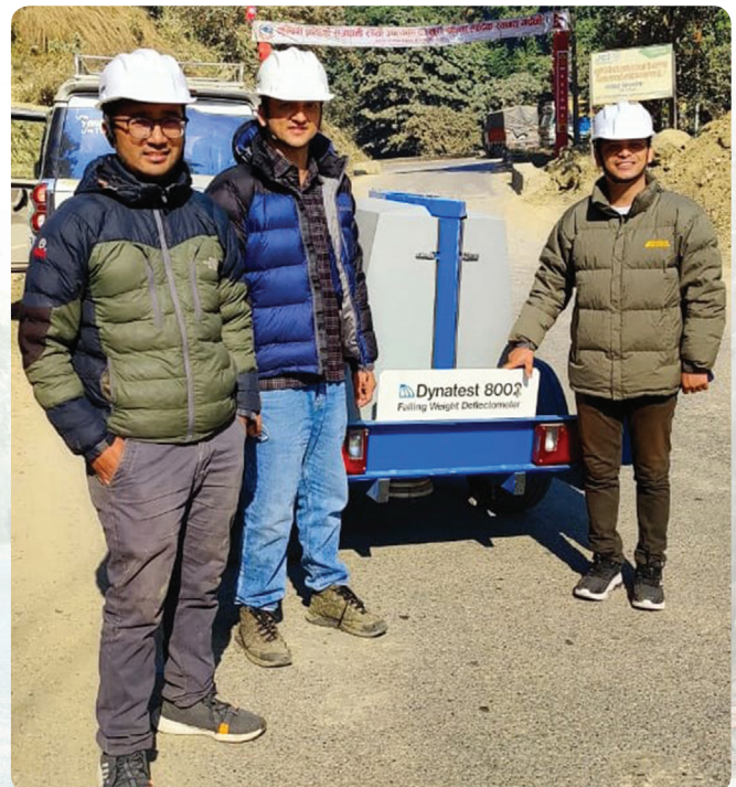
A team from the Department of Roads measuring pavement deflection at Dhan Khola to Lamahi section of East-West Highway.