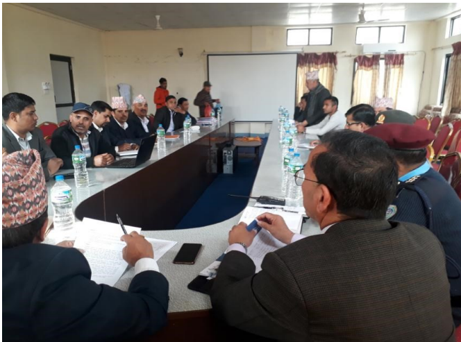
MCA-Nepal team with local representatives during the Compensation Fixation Meeting at Ratmate, Nuwakot.