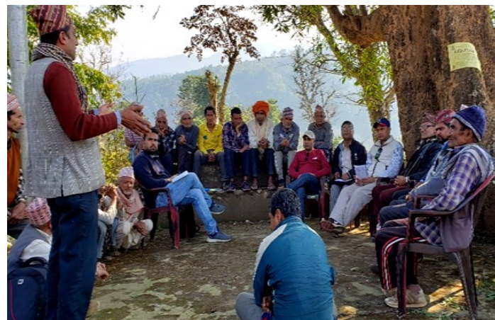
MCA-Nepal ETP Team addressing requests regarding re-alignment from community representatives .

The Environmental and Social Performance (ESP) – Land Acquisition and ETP team from MCA-Nepal visited four districts: Makwanpur, Chitwan, Dhading and Nuwakot from 9 - 13 of February 2020. The principal objective of the field visit was to find the feasibility of the route change requested by local residents of these districts as per the registered grievances.