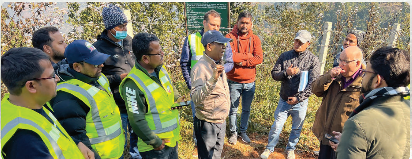
MCA-Nepal team facilitating potential bidders observing TL alignment at Gajuri in Dhading on 11 January 2023.