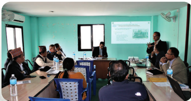
The district-level meeting conducted to issue notices on Land Acquisition in Tanahun district on 23 February 2023.