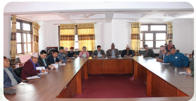
The district-level meeting conducted to issue notices on Land Acquisition in Palpa district on 24 February 2023.