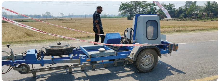
The deflection of road pavement at Nadaha in Saptari district being measured using FWD equipment on 29 March 2023.