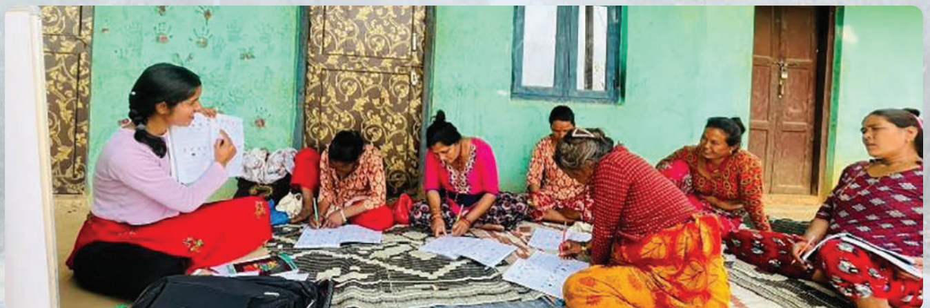
Project-affected people undertaking functional literacy and numeracy classes.