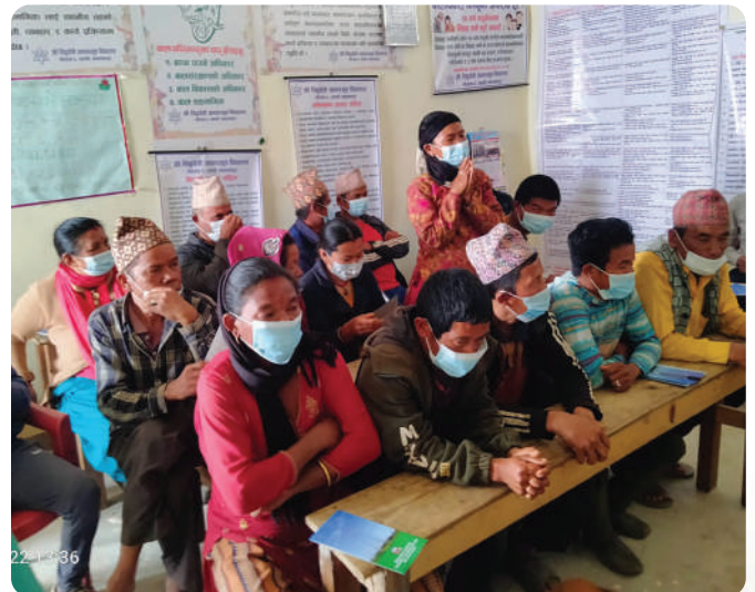
A CFUG consultation at Kailash Rural Municipality-6 in Makwanpur district on 22 February 2023.