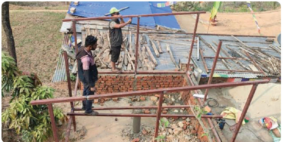
Goat sheds being constructed as additional support to trainees.