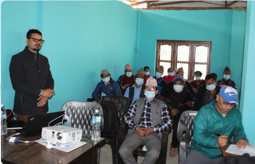
A CFUG consultation at Galchhi Rural Municipality-2 in Dhading district on 24 January 2023.