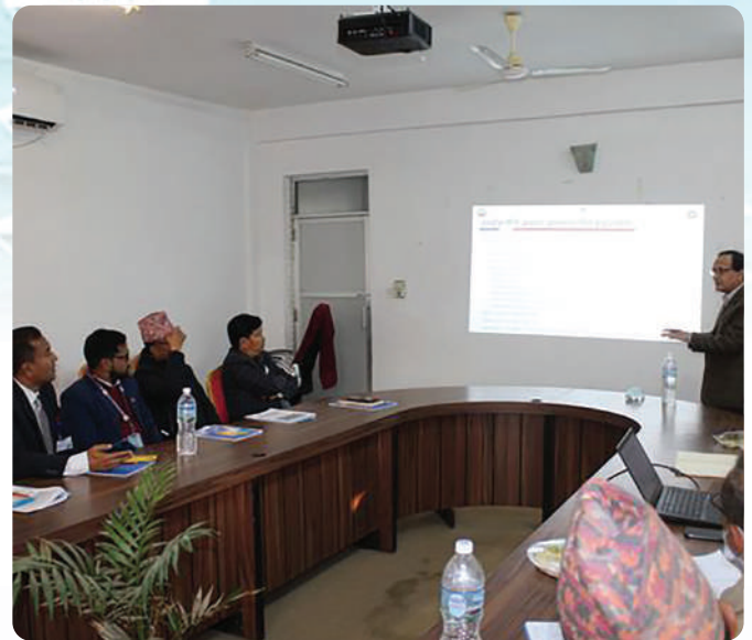
The district-level meeting conducted to issue notices on land acquisition in Chitwan district on 17 January 2023.

As per Clause 6 of the Act, all notices on land acquisition will be placed at public locations, nearby the concerned land or concerned rural municipality/municipality office, or doors or compound walls of affected properties, as preliminary action.