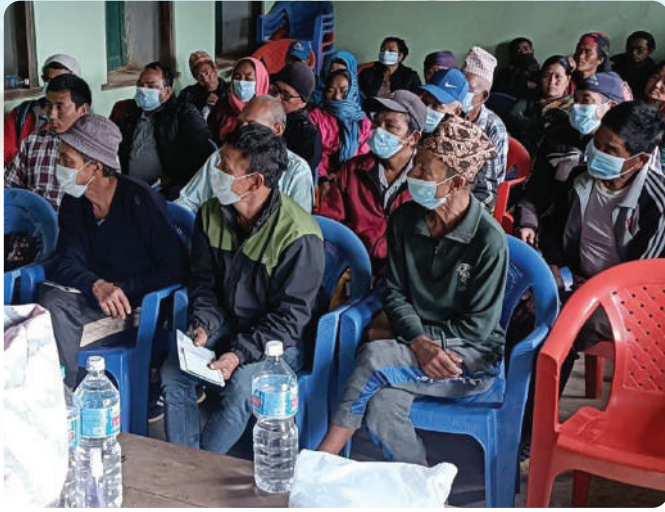
A CFUG consultation at Bandipur Rural Municipality-2, Tanahun district on 30 January 2023.

The transmission line will cross 121 Community Forests (CFs) and eight Leasehold Forests (LHFs).