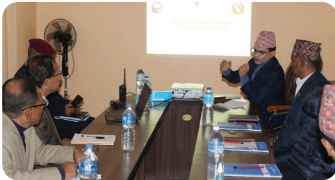
The district-level meeting conducted to issue notices on land Acquisition in Nawalparasi (Bardaghat Susta East) district on 18 January 2023.