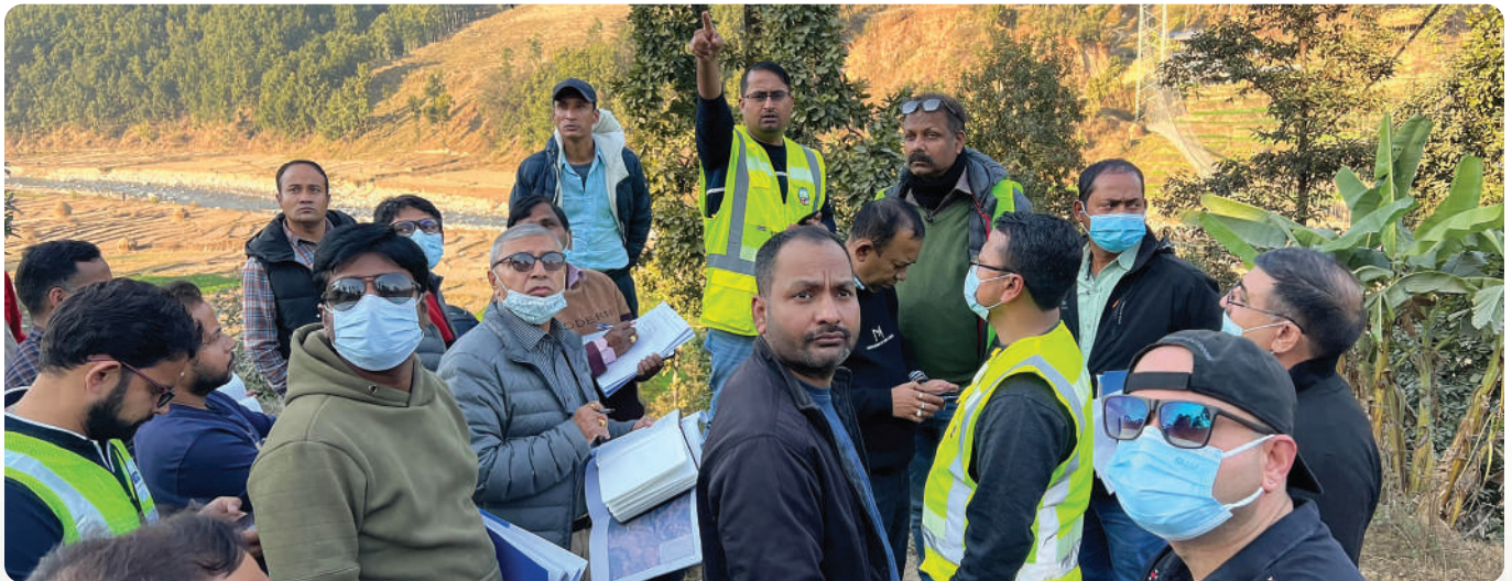
MCA-Nepal team facilitating potential bidders observing TL alignment at Likhu in Nuwakot on 10 January 2023

supply, delivery, installation, testing, and commissioning of the transmission line. The deadline to apply for the contract had been set for 27 March 2023.