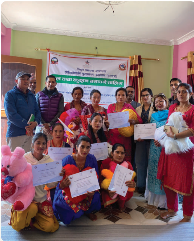
Doll and Cushion-Making Training graduates at the closing ceremony conducted on 5 March 2023.

The program is an integral component of MCA-Nepal's Resettlement Action Plan based on international standards to ensure improved means of livelihood for physically and economically displaced people.