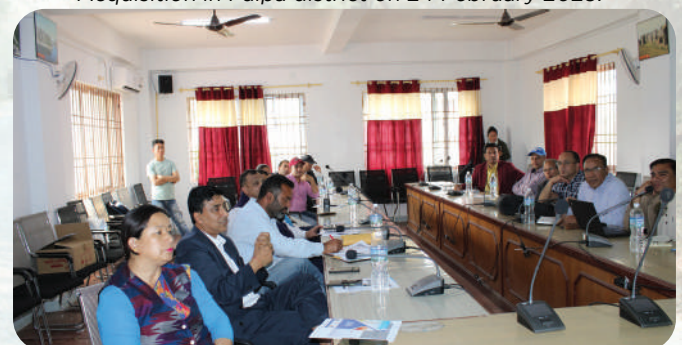
The district-level meeting conducted to issue notices on Land Acquisition in Makwanpur district on 16 March 2023.