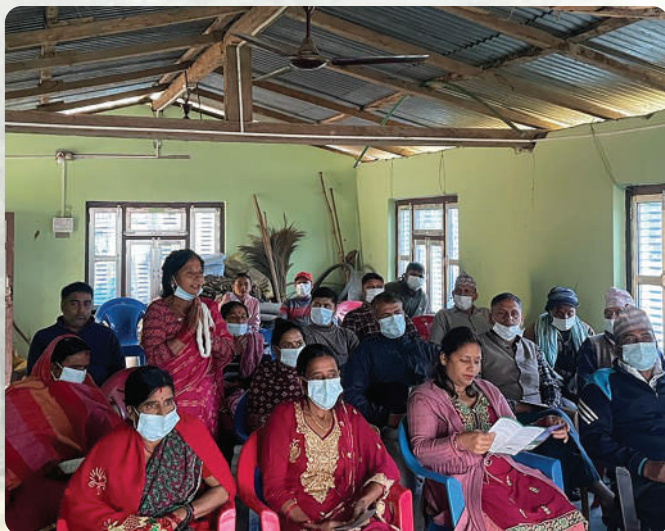
A CFUG consultation at Sunawal Municipality-2 in Nawalparasi (Bardaghat Susta West) district on 28 February 2023.