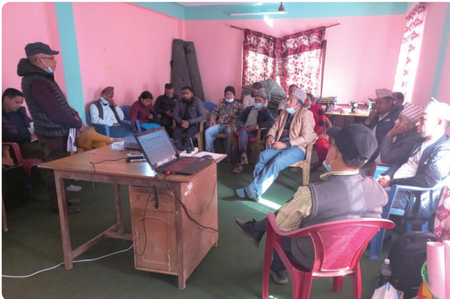
A CFUG consultation at Tarkeshwar Rural Municipality-2 in Nuwakot district on 26 January 2023.