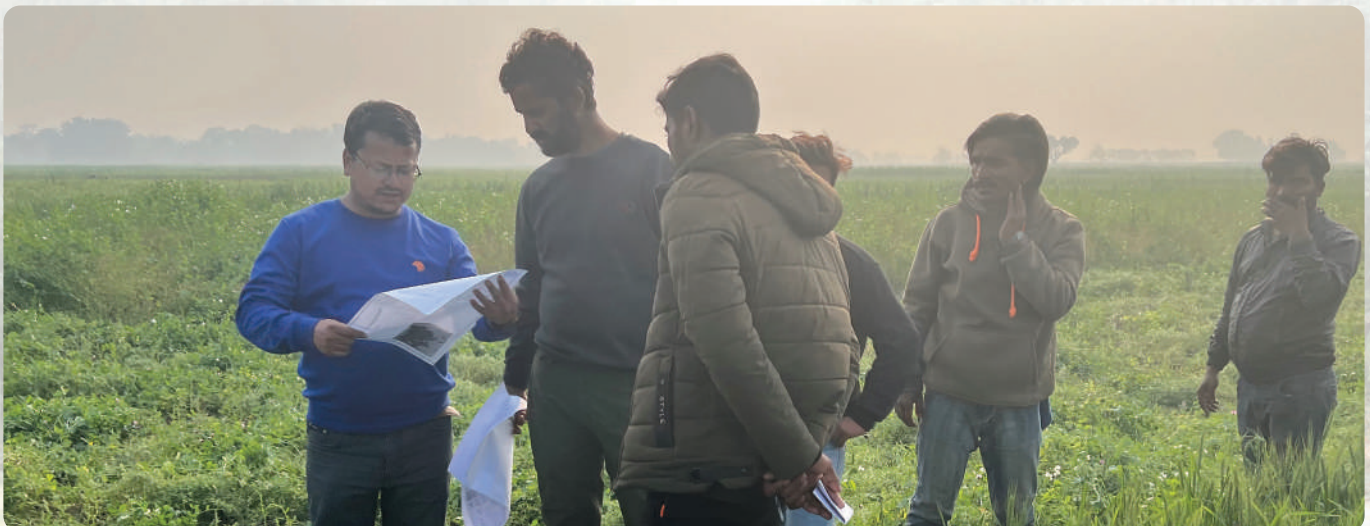
Cadastral survey of lands at Tolang, Ichhakamana Rural Municipality, Chitwan Thaha Municipality in Makwanpur district on 14 February 30 March 2023.