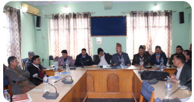
The district-level meeting conducted to issue notices on Land Acquisition in Nawalparasi (Bardaghat Susta West) district on 19 January 2023.