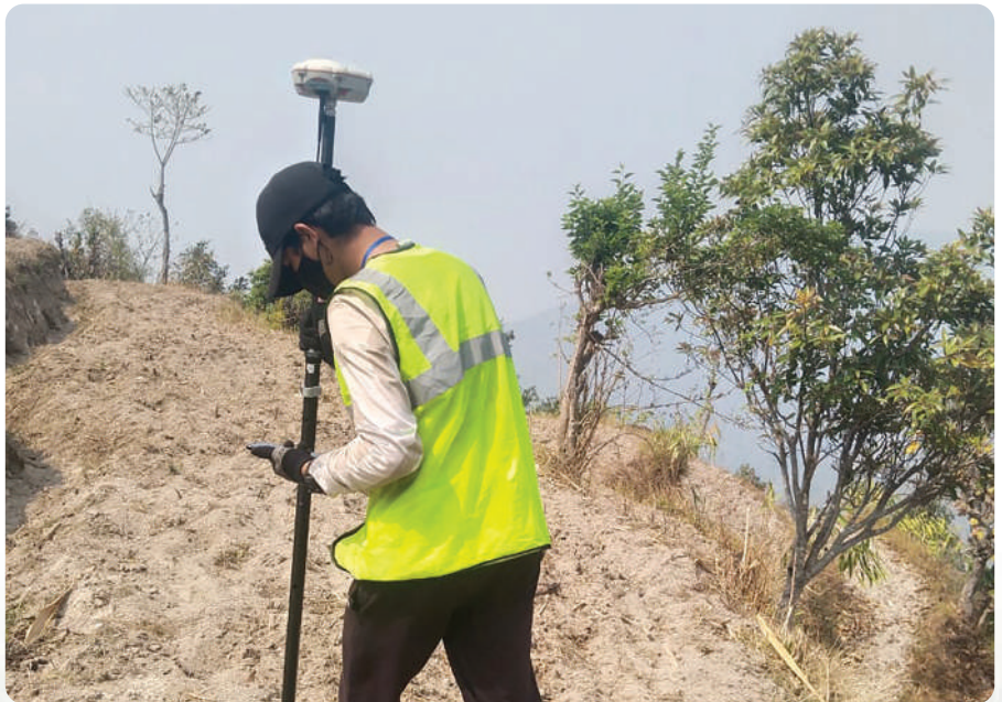
Cadastral survey at Rorang Benighat Rural Municipality in Dhading on 20 March 2023.