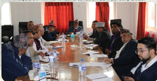
The district-level meeting conducted to issue notices on Land Acquisition in Dhading district on 26 February 2023.