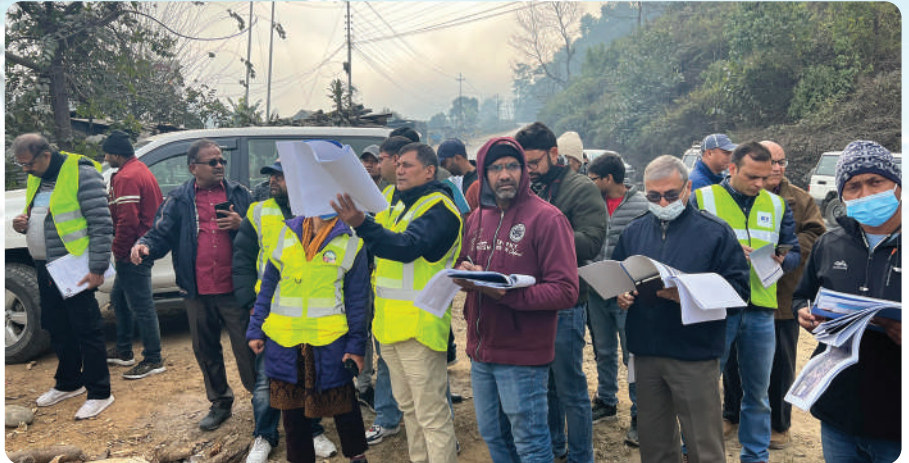
MCA-Nepal team facilitating potential bidders observing TL alignment at Kharamtar in Dhading on 11 January 2023

Specific questions related to the sites from the participating prospective bidders were clarified by the MCA-Nepal team.