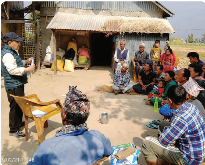
A CFUG consultation at Kailash Rural Municipality-5 in Makwanpur district on 21 February 2023.