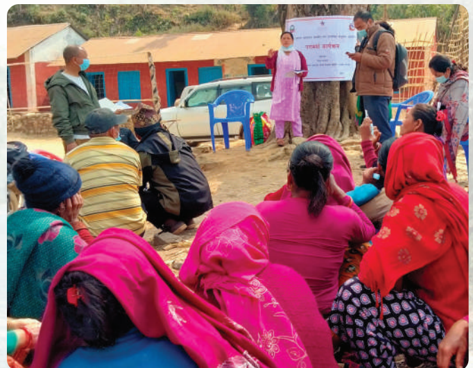
A CFUG consultation at Nisdi Rural Municipality-7 in Palpa on 1 March 2023.