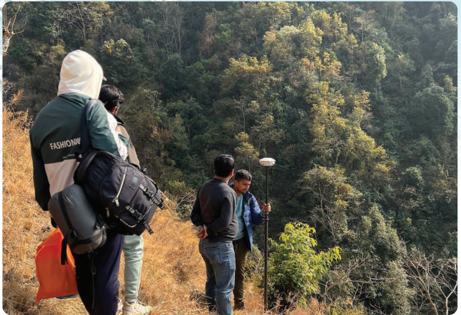
Cadastral survey at Ichhakamana Rural Municipality in Chitwan on 5 February 2023.

As per the preliminary action of Clause 8 of the Land Acquisition Act, 1977, such surveys should be completed within 15 days after notices are issued to determine whether the land is suitable for acquisition before a report is submitted to the local office.