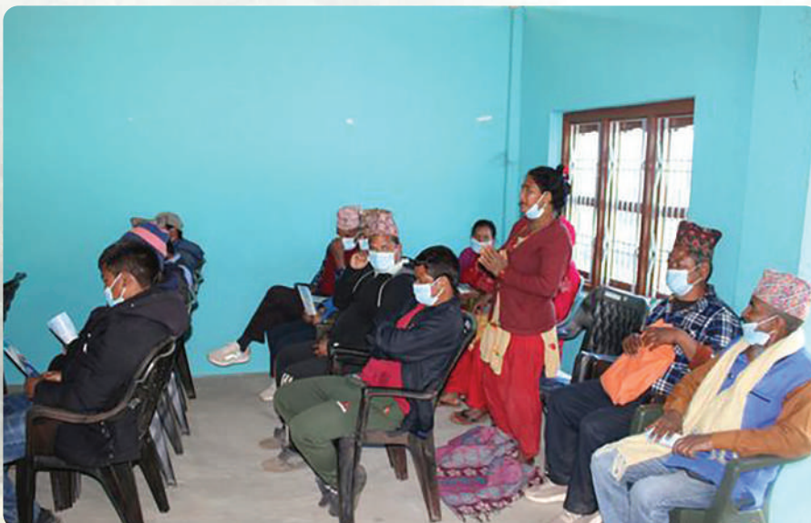
A CFUG consultation at Siddhalek Rural Municipality-6 in Dhading district on 27 January 2023.

MCA-Nepal has organized a series of consultations with various Forest User Groups (FUGs), including Community Forest User Groups (CFUGs) and Leasehold Forest User Groups (LFUGs), in the project-affected districts of Nawalparasi (Bardaghat Susta West), Nawalparasi (Bardaghat Susta East), Makwanpur, Palpa, Chitwan, Nuwakot, Tanahun, Sindhupalchowk and Dhading.