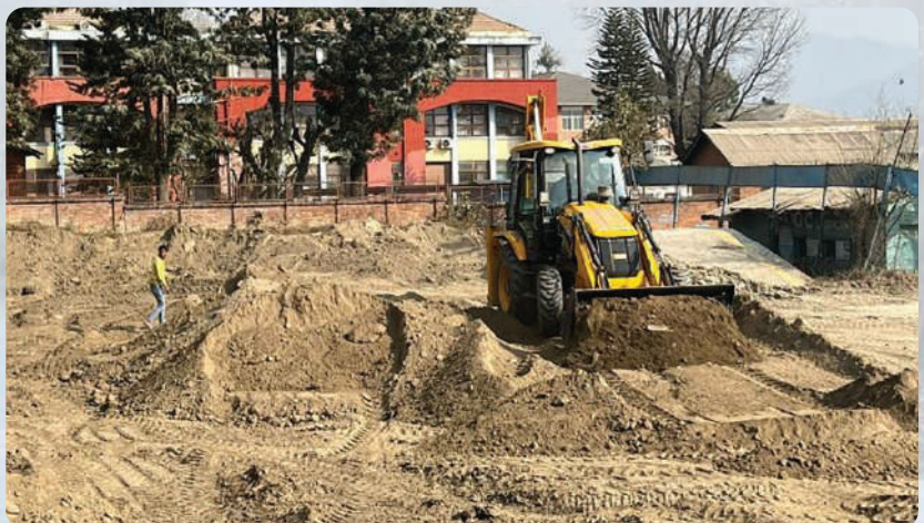
JCB Operation Training being conducted in Bhaktapur from 5 February 2023.

Other vocational training organized as per the choices of project-affected people in the months of February and March included sweets and snacks production, electrical work, plumbing, tailoring, automobile mechanics, beautician skills, Dhaka weaving, barista skills, cooking, driving and heavy equipment (JCB) operation.