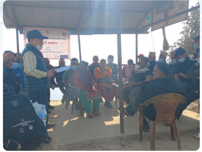
A CFUG consultation at Lamachaur in Belkotgadhi Municipality-5, Nuwakot district on 4 February 2023.