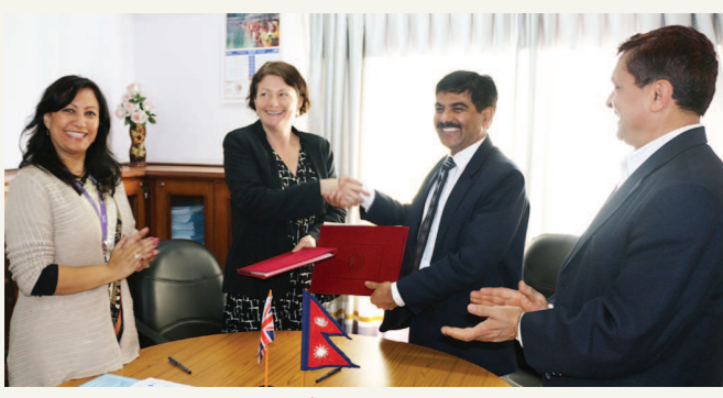
A Glimpse of MoU Signing Program

between the GoN and the Government of UK. This MoU provides transparent and a accountability mutual framework between the two Governments on development assistance and covers commitments on Official Development Assistance (ODA) to be provided by the UK through DFID to Nepal.