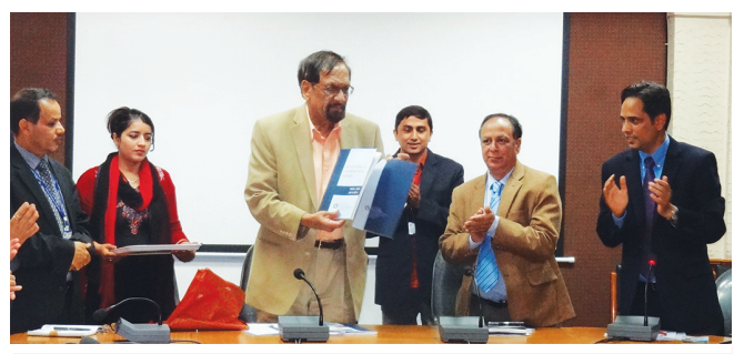
Hon. Finance Minister Unveiling DCR, 2013-14

The DCR revealed 71 percent of aid disbursed on-budget