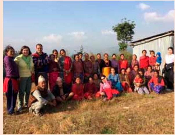
■ Through community action centers organized under the program, over a million citizens across Nepal participate in local development planning.

The case story is an example of how the CAC members are coming together proactively in innovative and sustainable ways to resolve their needs. The story has not only helped their case but also encouraged other non-CAC individuals to initiate pig farms in the immediate area. Two brothers in the adjacent land have also initiated their private pig farm with a much higher investment.