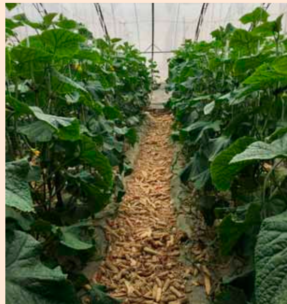
Greenhouses with improved groundwater irrigation system in Yongji City (photo by ADB).

novelty, intense dialogue with the farmers, coupled with training courses on the use of the technology helped farmers understand and finally accept the new systems. In 2012, the new irrigation systems became operational. Farmers saw the effects of improved groundwater management firsthand, and today, water associations promote the irrigation systems together with county authorities.