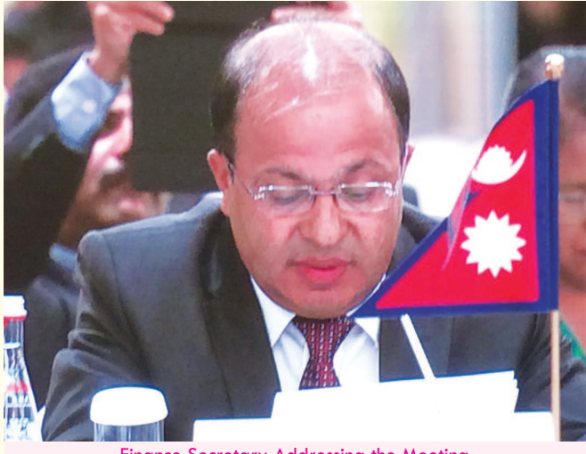
Finance Secretary Addressing the Meeting

The First Annual Meeting of the Asian Infrastructure Investment Bank (AIIB) was convened in Contd P4