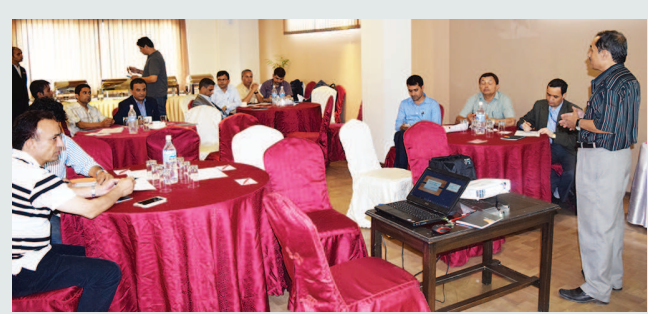
A Glimpse of Discussion Program

A discussion program was organized for IECCD officials to discuss on the preparation of Development Cooperation Report in Nepali. The draft was shared and discussed very minutely while finalising the document. The discussion also reviewed the current work allocation of IECCD staff and provided suggestions for further improvement. This discussion program was facilitated by Effective Development Financing and Coordination Project in the Ministry of Finance being supported by UNDP/DFID.