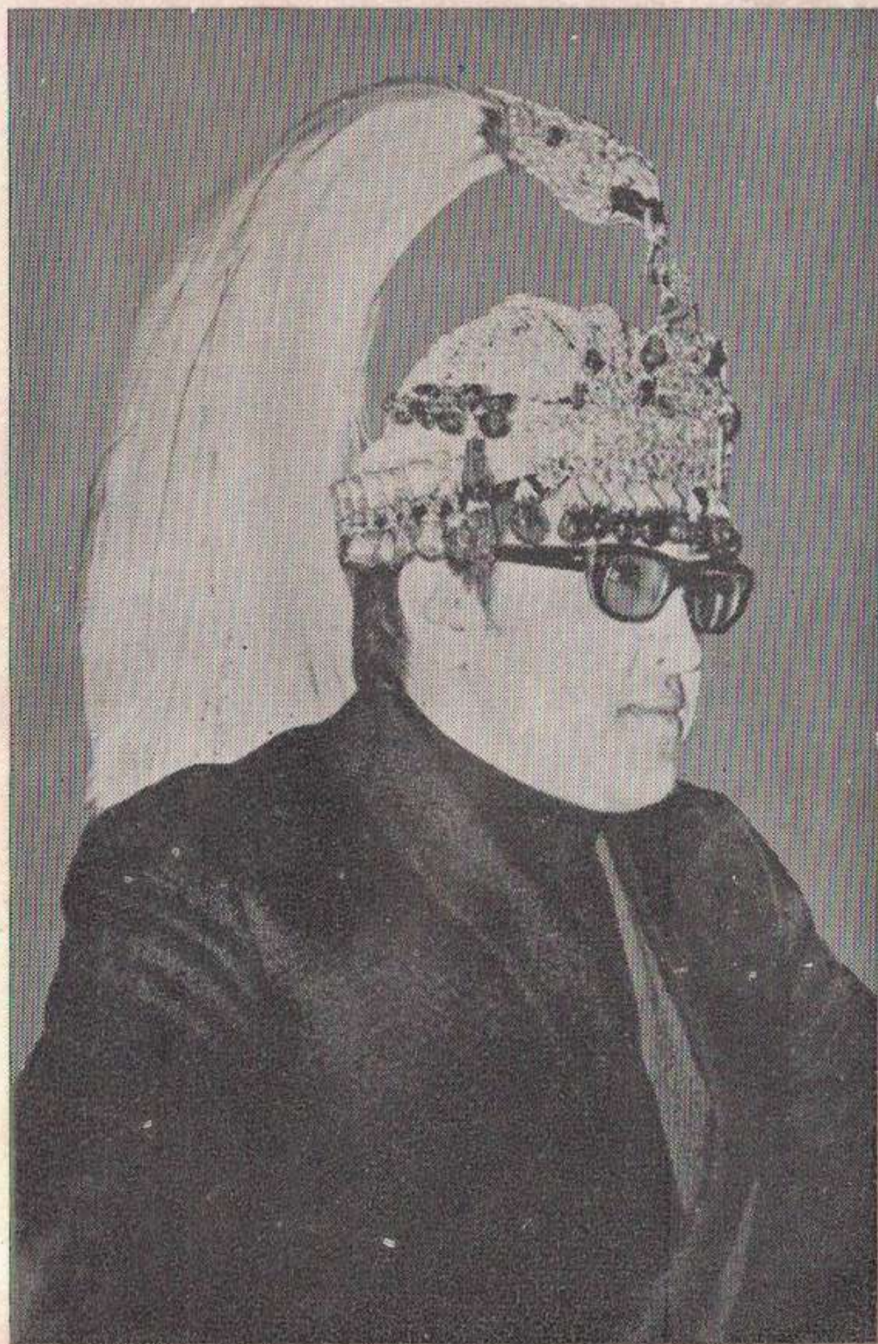
His Majesty King Birendra Bir Bikram Shah Dev