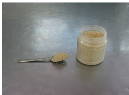
▲ Dried Powder Ginger