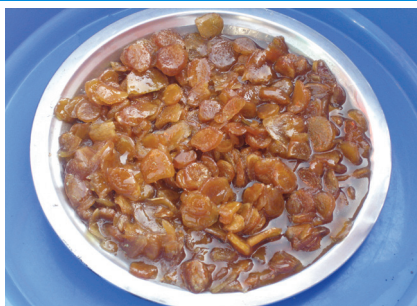
▲ Ginger Syrup