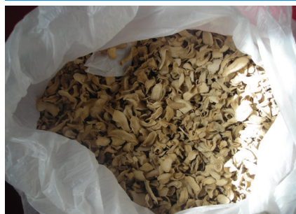
▲ Dehydrated Ginger (Sutho)