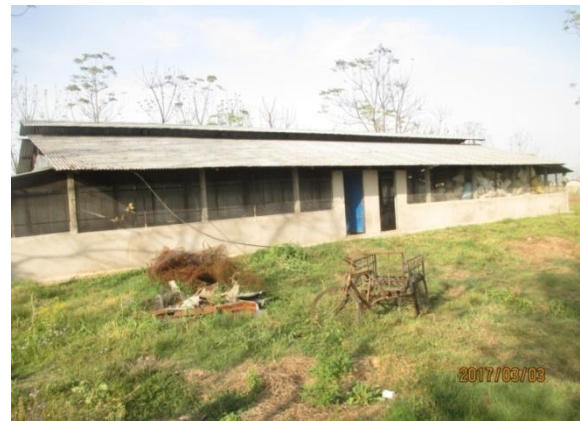
Waste collection and segregation center at Narayani

Community based solid waste management program was found very successful in Narayani Municipality. In total three locals are employed for segregation with RS.12500 per months' salary. Hard plastic wastes sell in Rs.40/kg and soft in rs.20/kg and polythene bag in rs.6/kg. This could be a successful initiative and hence deserve replication and upscaling. Moreover, it was suggested to prepare business plan of the activities and adopt strategies accordingly so as to maintain at least equal cost benefit ratio.