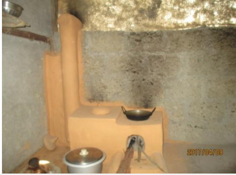
Improved Cooking Stoves, Sindhuli

Therefore, the pond rehabilitated through multi stakeholder engagement has provided multitude of benefits including conserving biodiversity, increasing income to local communities and maintaining water table.