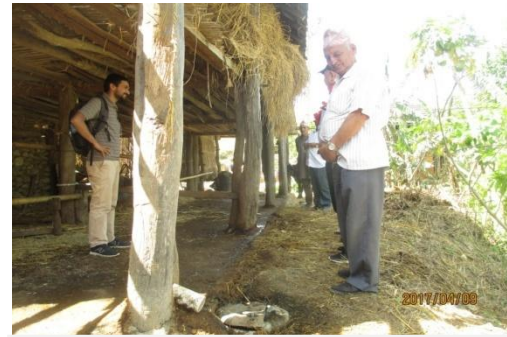
Improved Livestock Shet, Sindhuli

Municipality Ward No. 2 & 3 (Previously known as Bhimsthan VDC) has adopted a total of 150 Improved Cooking Stoves (ICS) and a few biogas plants, underwent environmental awareness training and implemented improved cattle sheds. Priority of the support was given to poorest of the poor sections of the society.