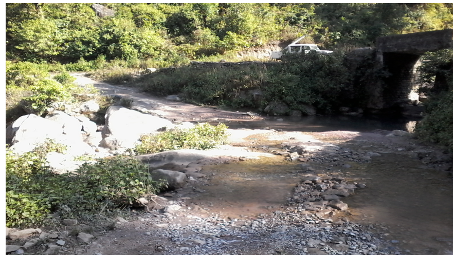
Caption:cross section from left