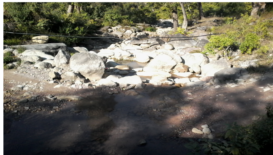
Caption:longitudinal section from upstream