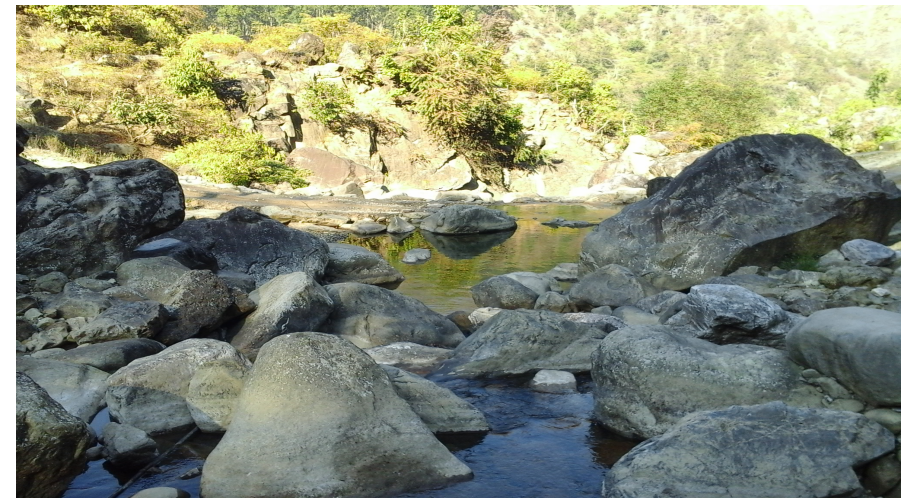
Caption:elevation from upstream