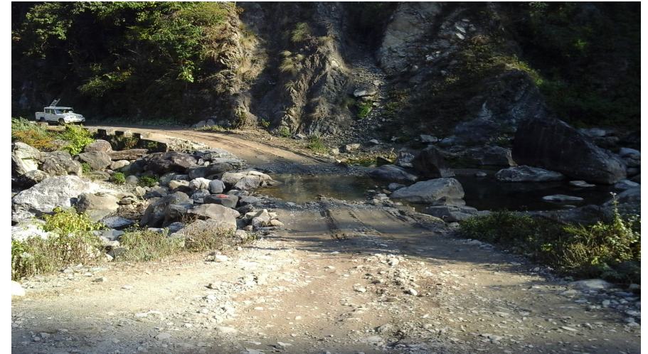
Caption:Cross section from left