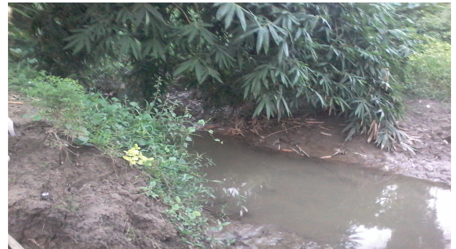
Caption:from downstream right