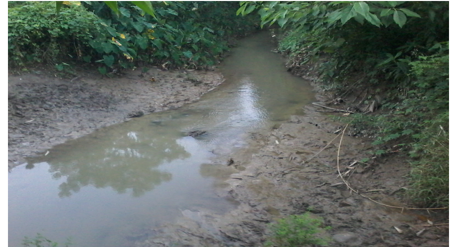
Caption:from upstream right