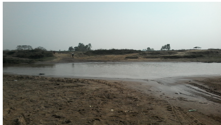
Caption:cross section from right bank