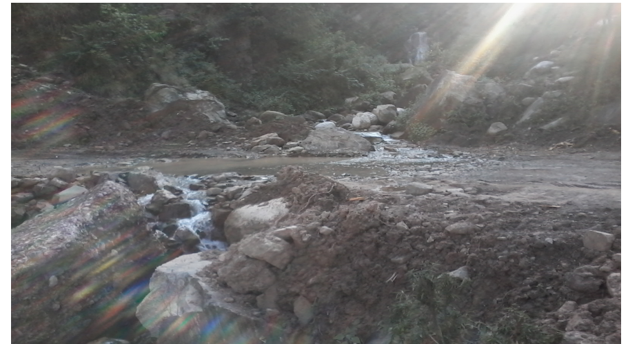
Caption:longitudinal section from downstream