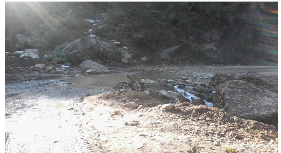
Caption:cross section at right