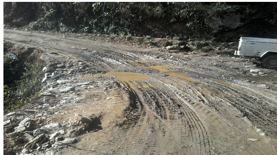
Caption:From left side