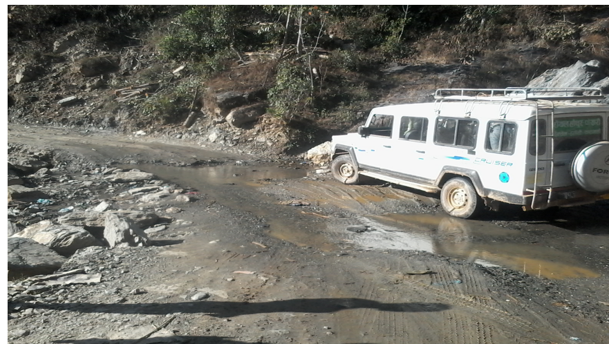
Caption:From left side