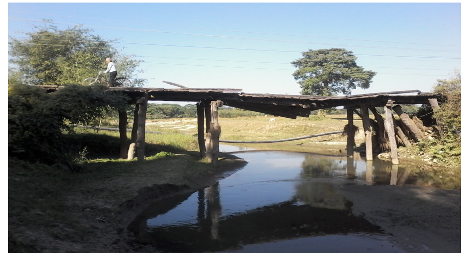
Caption:Existing timber bridge