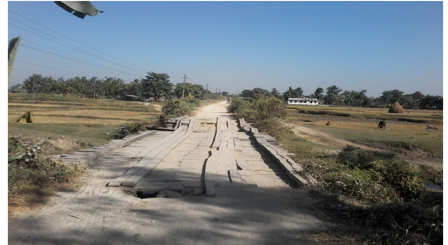
Caption:running surface of timber bridge