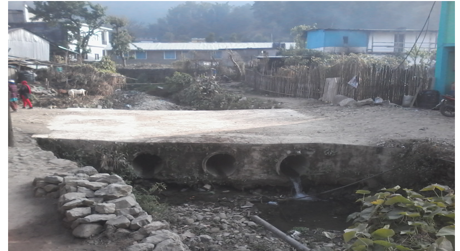
Caption:elevation from downstream