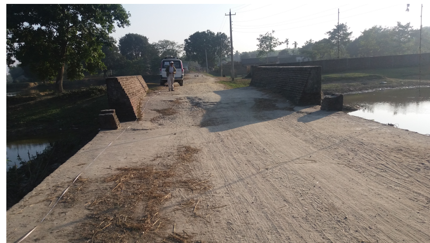
Caption:cross section view