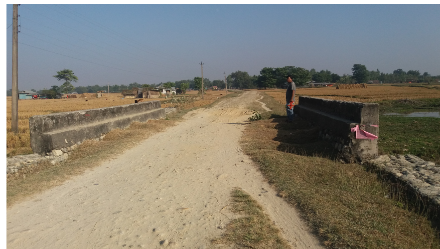
Caption:cross section view