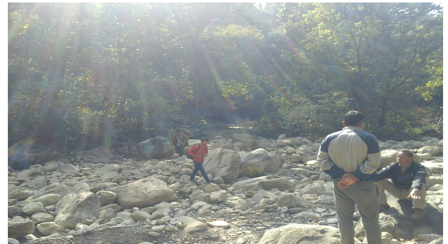
Caption:Cross section from right