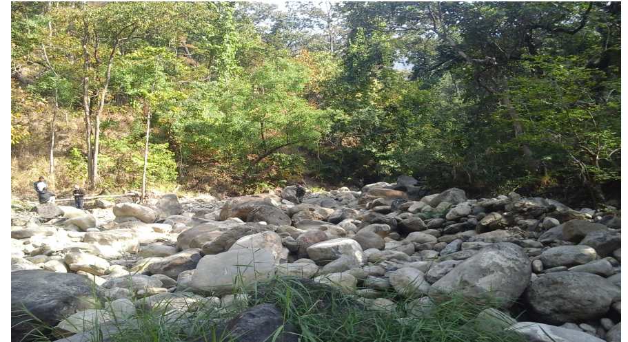
Caption:elevation from downstream