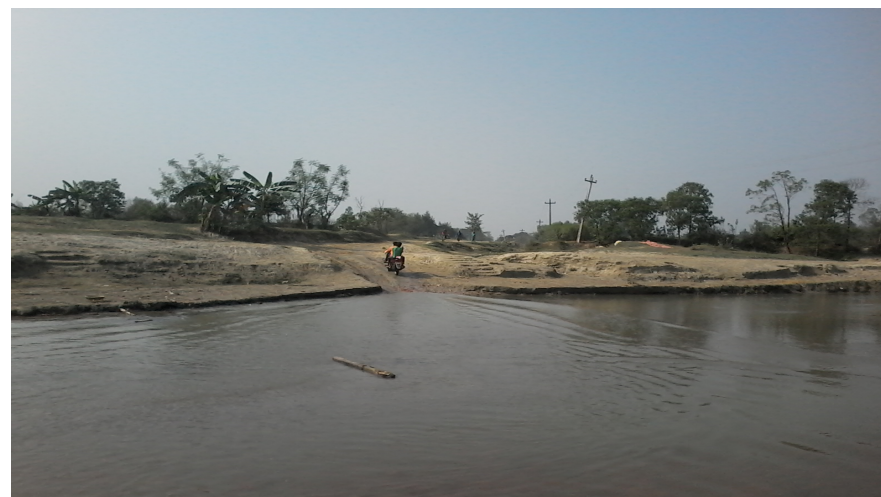
Caption:cross-section from right bank