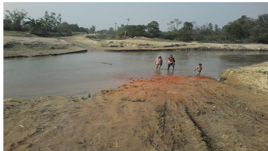
Caption:cross-section from left bank