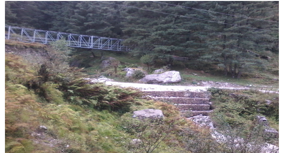
Caption:Longitudinal Section From DownStream