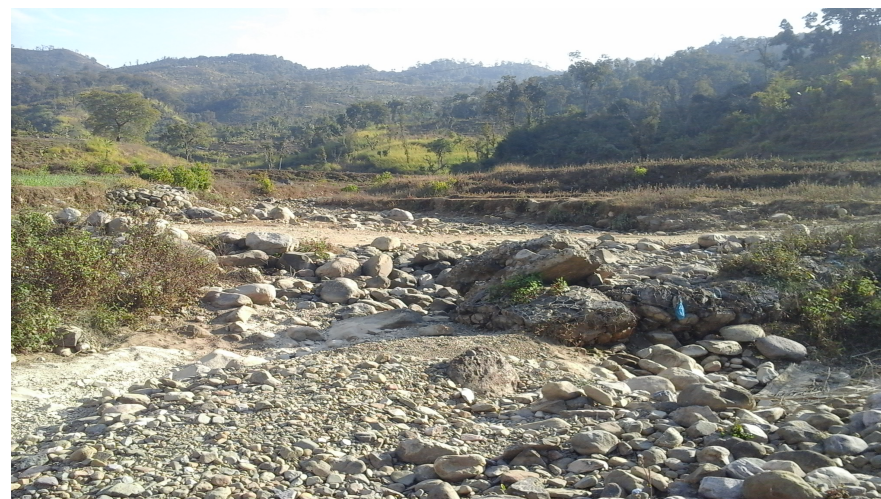
Caption:longitudinal section from downstream