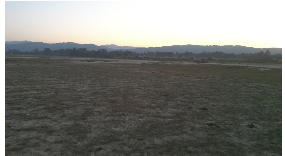
Caption:L section 2