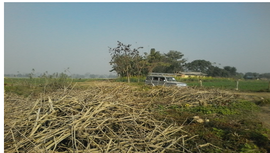
Caption:way to nepalgunj