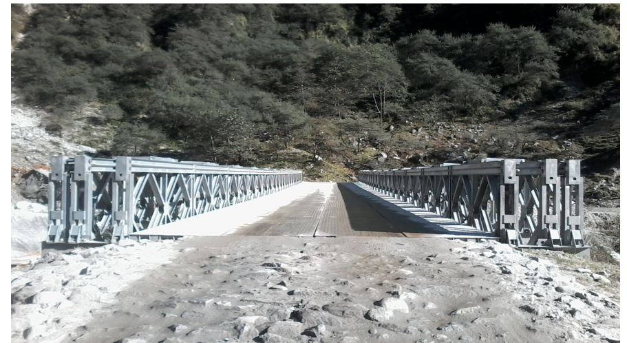
Caption:cross section view