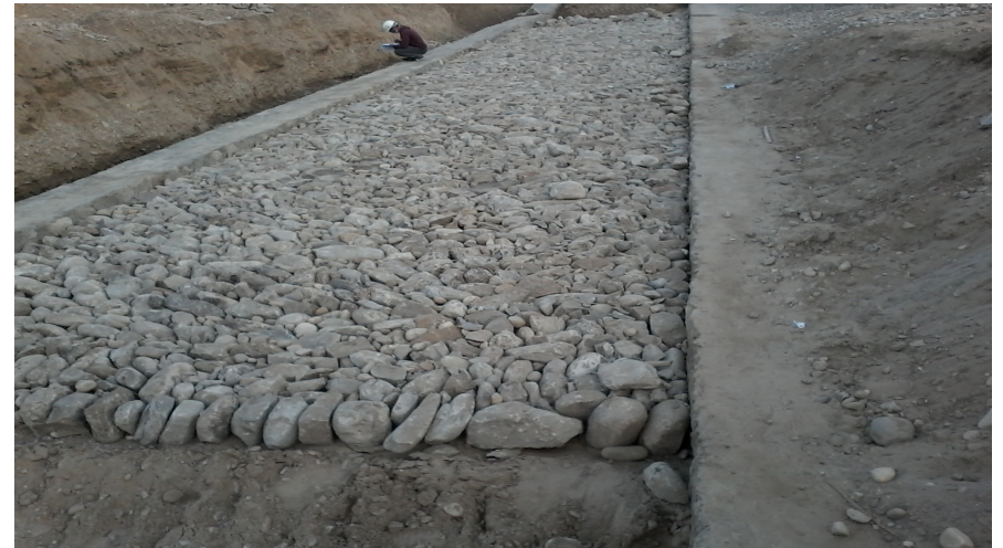
Caption:construction in process