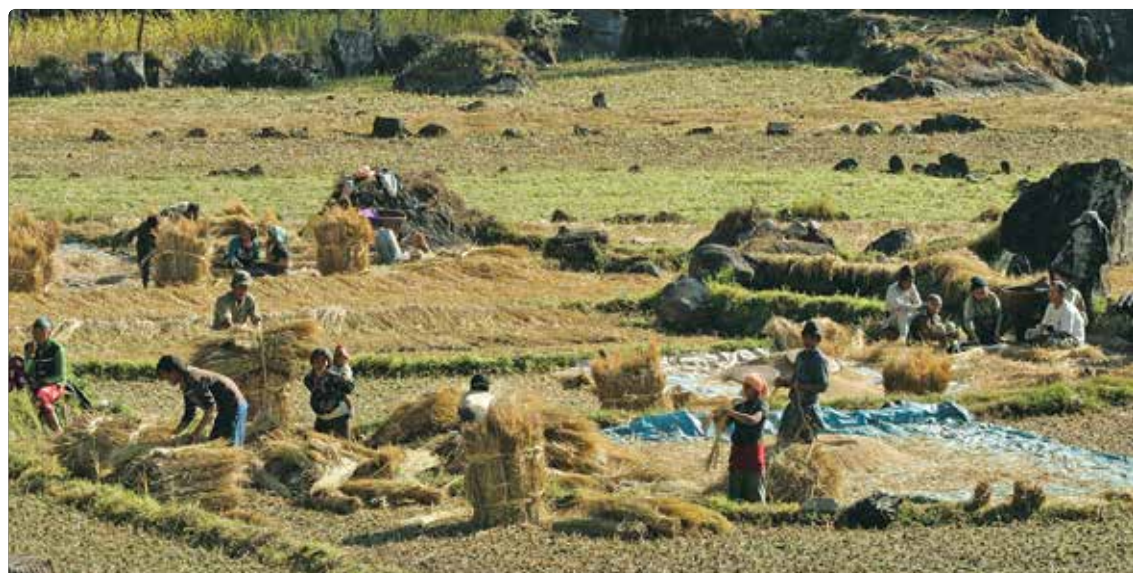
► Harvesting brings the whole village together.

The UN, international and local NGOs and Civil Society Organisations (CSOs), academia and researchers, and private sector actors are essential partners in the design, planning, and implementation of Nepal's various FSN plans. The NPC and other government structures must oversee and manage the coordination of multiple layers of organizations working in nutrition-sensitive agriculture and food system approaches. With the many activities proposed, progress tracking platforms and accountability mechanisms must be instilled to ensure smooth implementation. In addition, the three policies have distinct implementation mechanisms that must be coordinated by the NPC, making it unclear if this coordination will streamline activities towards SDG2 or simply create additional complications.