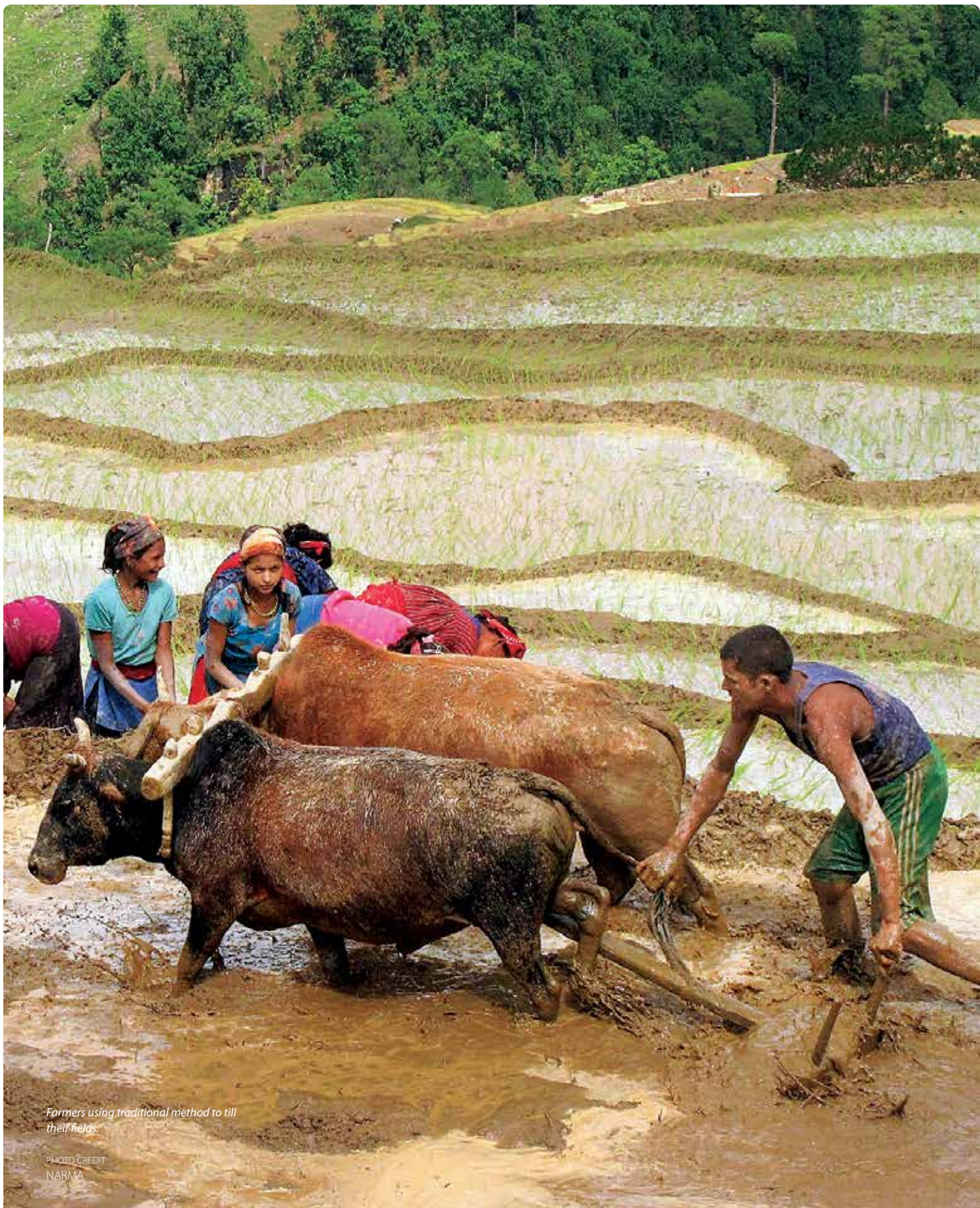
Farmers using traditional method to till their fields.