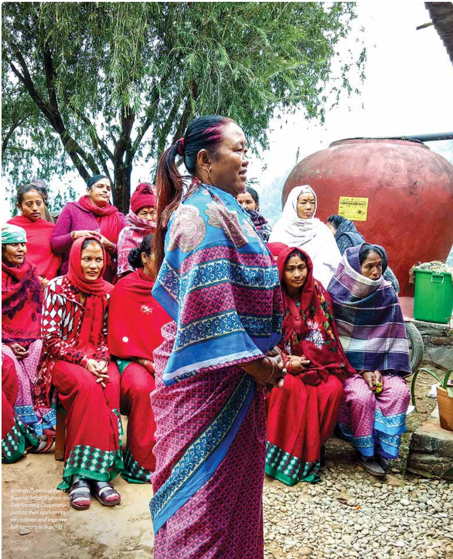
Women farmers of Kaski Rupatal Rehabilitation and Fish Farming Cooperatives putting their opinions to rehabilitate and improve fish farming in Rupatal.