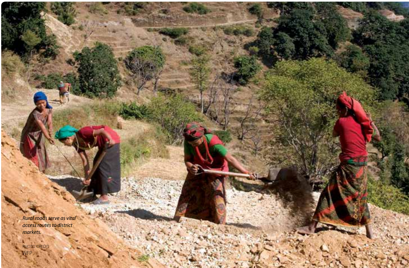
Rural roads serve as vital access routes to district markets.

The recommendations for Nepal are grounded in the five targets of SDG2 – which are to end hunger, end all forms of malnutrition, double the productivity of small scale producers, sustainable food system and agro-biodiversity conservation. These recommendations should be implemented in a way that addresses the broader challenges impacting the country that were outlined earlier in this Review. The recommendations were formulated using the latest evidence of what has made an impact on hunger, food insecurity, nutrition vulnerability, and unsustainable food systems. In addition, the recommendations were formulated based on other national or expert reports that have assessed the food security and nutrition situation in Nepal as well as “what has worked” in other country settings.