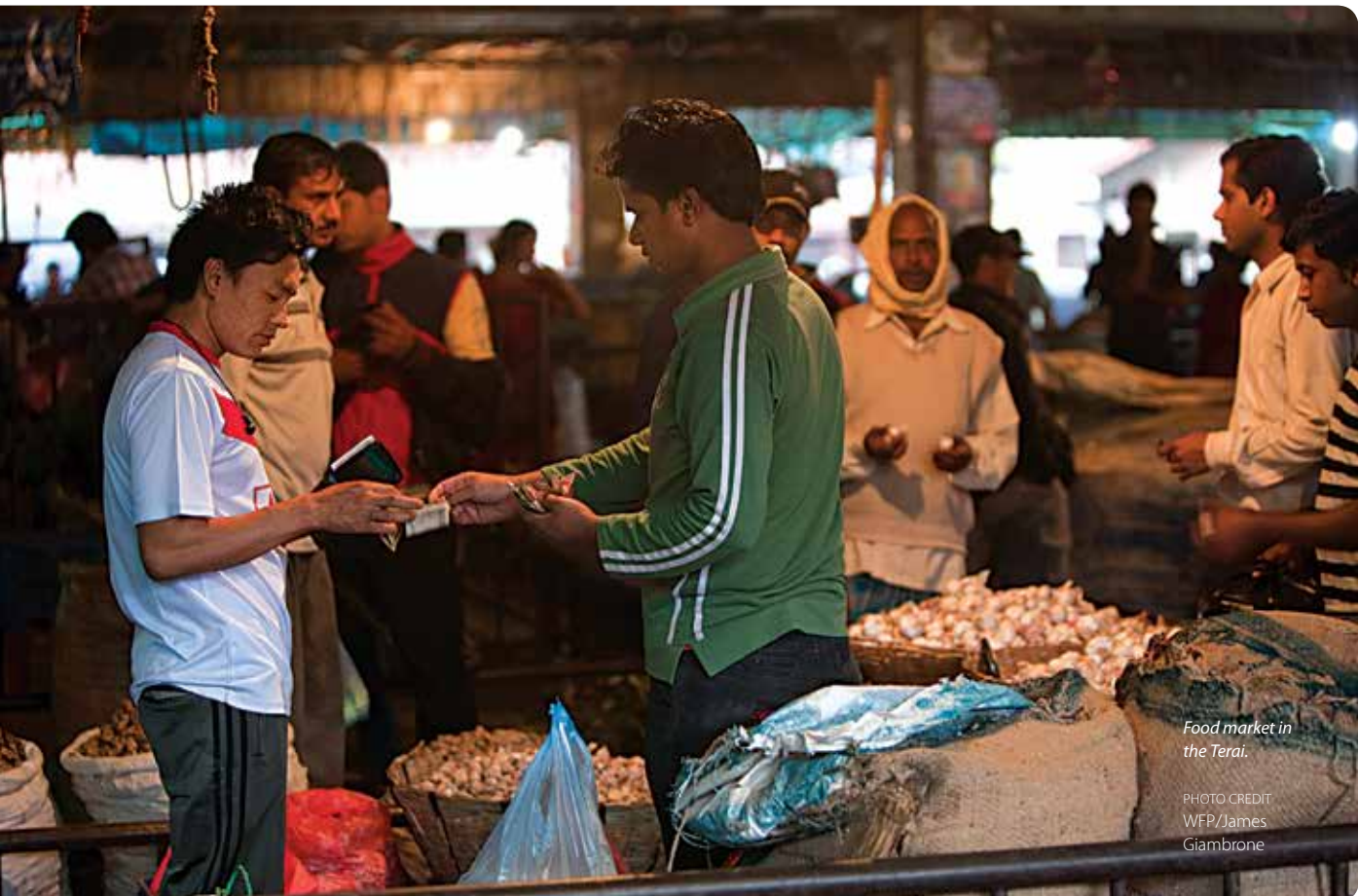
Food market in the Terai.