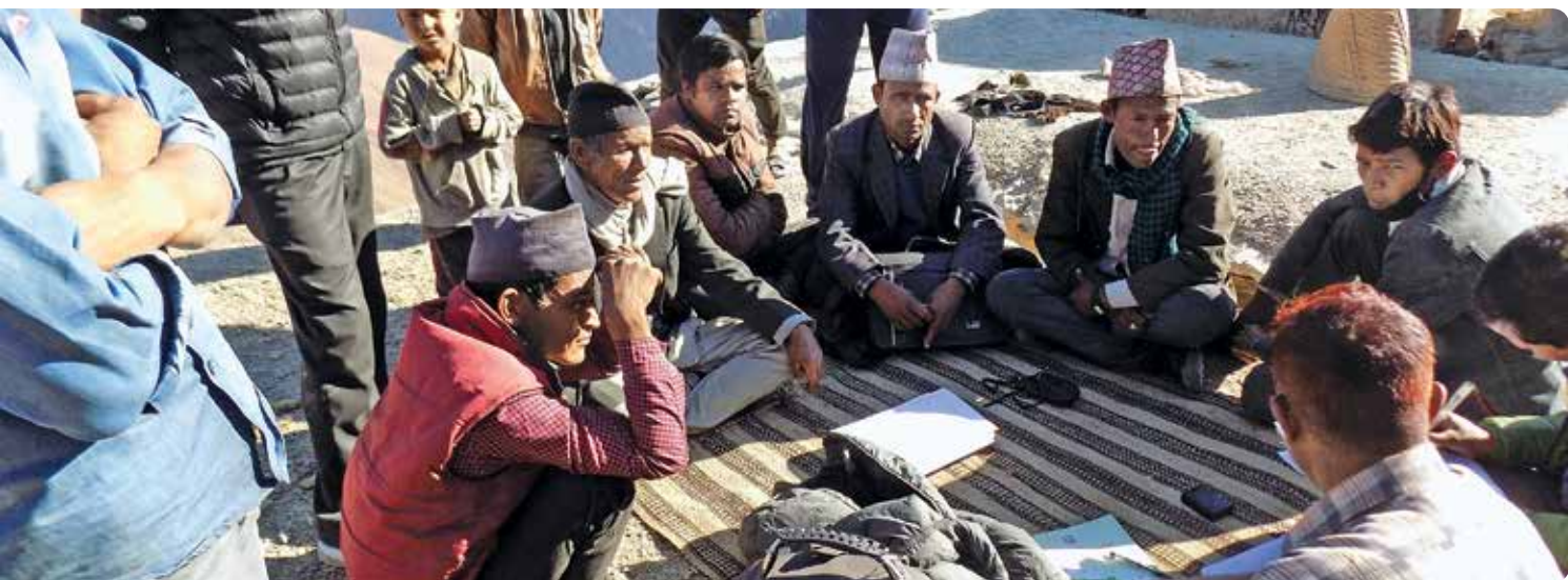
▲ Community discussions in Humla, help to identify needs and recognise priorities.